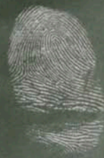
5. R. LITTLE FINGER