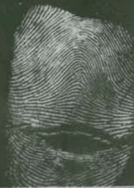
8. L. MIDDLE FINGER