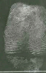
9. L. RING FINGER