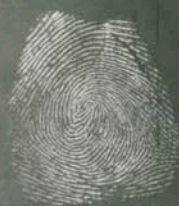
6. LEFT THUMB