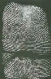
7. L. FORE FINGER