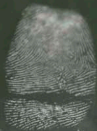
2. R. FORE FINGER