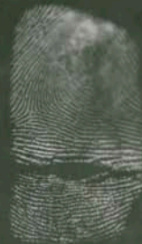
4. R. RING FINGER