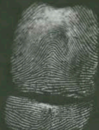
3. R. MIDDLE FINGER