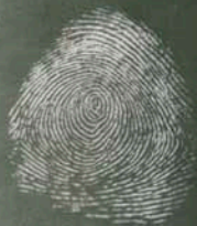
1. RIGHT THUMB