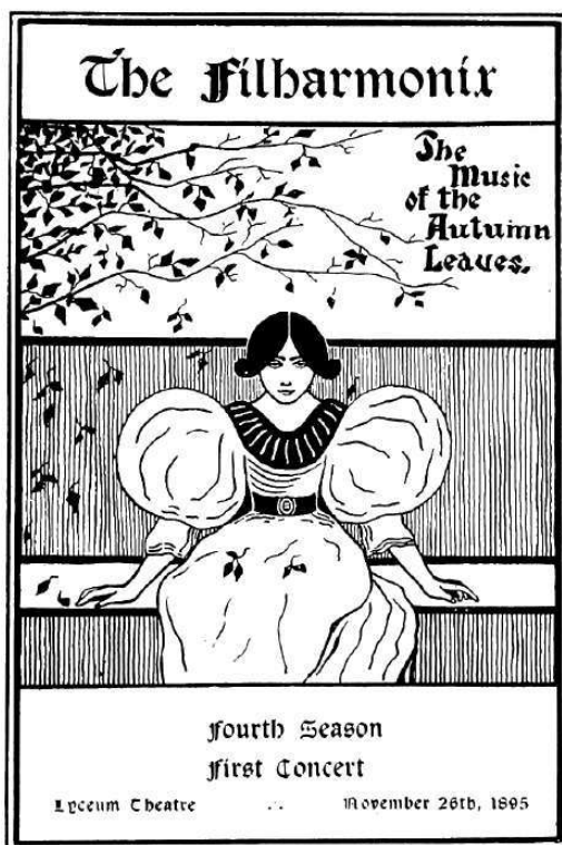
COVER of an early Filharmonix program

In 1901–02 it had enjoyed a last flicker of glory, but there had been a note of desperation in its promotional appeals. Minneapolis was promised a “new venture,” a “mammoth undertaking,” a “grand symphony orchestra” which would give eight concerts at the Metropolitan Opera House. Concertgoers were urged to buy season tickets in quantities large enough to defray