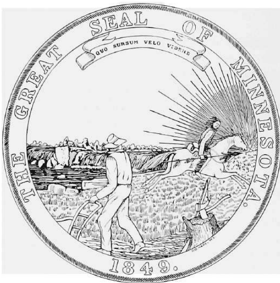
THE territorial seal, actual size

ery when he became Minnesota's first superintendent of public instruction in 1860.