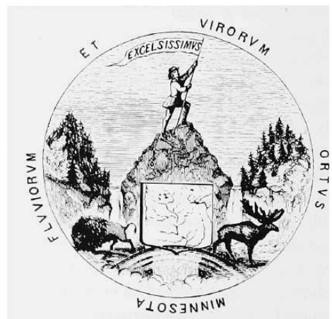
NEILL'S design for a state seal

The story of its subsequent adventures can be traced in a series of letters recently discovered in the state archives and in the