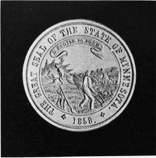
THE original die of the great seal, actual size