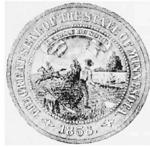
THE present great seal of the state