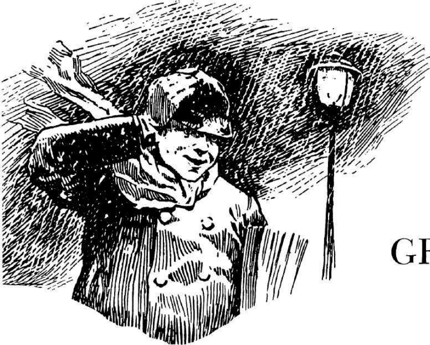
FROM the St. Paul Globe greeting, 1888