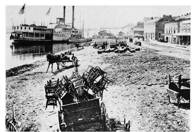
SPRING on the St. Paul levee

and speculators. Settlers, who having made entries upon land, were going at the opening of the Spring to live upon their properties in accordance with the requirements of the law. Speculators, who had the year before made purchases of real estate in the town or vicinity, came up to look at their investments and to see what could be done in the way of "booming." The transfers of real estate became frequent and values rapidly increased. It was, however, a steady, healthy increase warranted by surroundings and situations. The town was not yet in the throes of a real estate boom such as came later on in its history. We gained, too, as citizens men who did much to build and improve the town. St. Paul grew. Newer and better buildings were put up on almost every street; and the town took on an appearance of enterprise and substantiality.