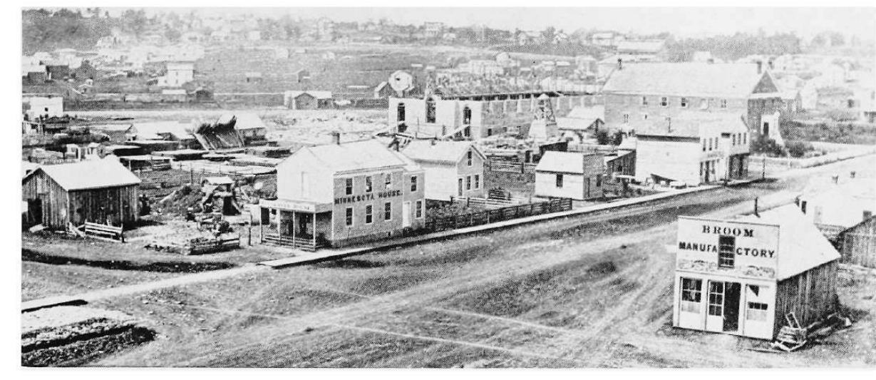
THE vicinity of Fifth and Wabasha Streets, St. Paul, 1857

niggardly in the matter of expenditures, and, while their money might not have purchased clothes that showed the skill or fashion of eastern tailors, hatters or haberdashers, yet they were the best that could be got in St. Paul. Sometimes, too, there was a certain degree of brilliancy added by the presence of officers from the garrison at Fort Snelling. Dancing would continue until 3 or 4 o'clock in the morning with an intermission of an hour or more for supper at midnight. A few private parties were given at homes of some of the residents.