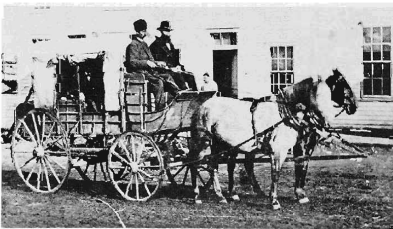
AN early Minnesota stagecoach