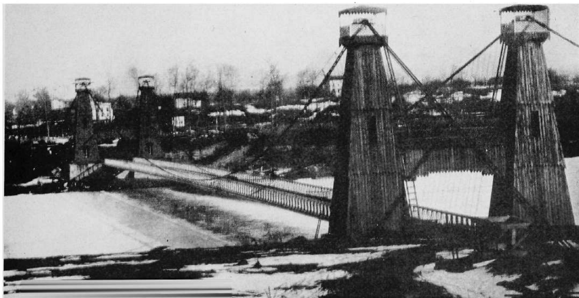
THE Suspension Bridge between Nicollet Island and Minneapolis

MR. NEWHALL is curator of the George Eastman House at Rochester, New York, and the author of a definitive history of photography (New York, 1949). He visited the Minnesota Historical Society in 1948 to study and photograph its daguerreotypes, and most of the examples here reproduced were copied at that time.