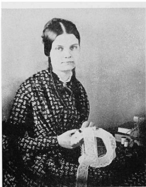
PORTRAIT of a young girl sewing