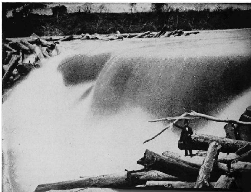
THE Falls of St. Anthony

In a manner almost unparalleled, the French government bought Daguerre's invention and presented his secret technique to the public. On August 19, 1839, in the Palace of the Institute of France, the famous scientist François Arago described the process in detail. Within days, daguerreotypes were being taken in France, and within weeks in America. As early as September 16, a daguerreotype was made in New York.