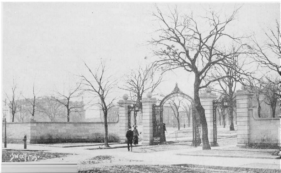
UNIVERSITY of Minnesota entrance gate, 1904

I congratulate Minnesota on the rich background of its colleges and universities and particularly on the wonderful institution which is celebrating its one-hundred-and-fifth birthday today—the Minnesota Historical Society.