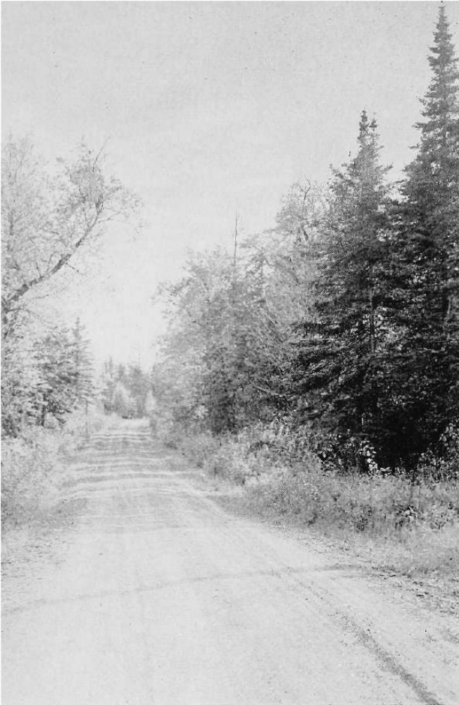
HIGHWAY 61 east of Two Harbors, 1917