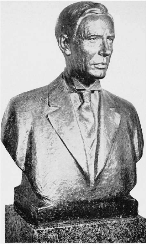
PAUL Fjelde's bust of Lindbergh

publishing a large and attractive magazine that appeared to be a general interest periodical but actually was devoted to attacking the League. Elaborate advertising solicitations were issued and a staff of clerks was employed to make up a list of two hundred thousand Minnesota farmers from tax lists, rural telephone directories, lists of rural newspaper subscribers, and so on. 17