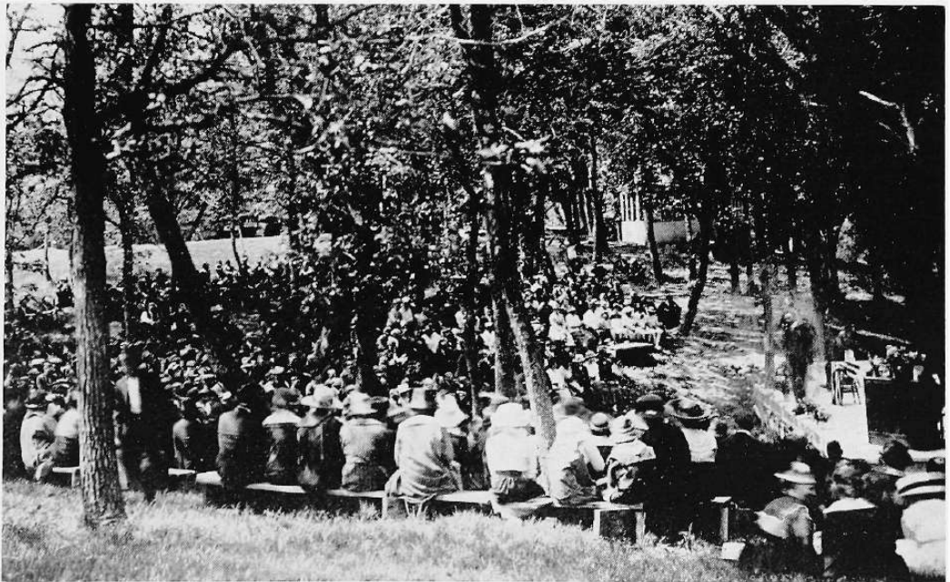
LINDBERGH speaking at a League picnic, Fort Ridgely, May, 1918

To make clear his position on the war, Lindbergh personally published in July,