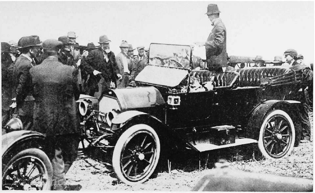
CAMPAIGNING for Lindbergh in Carver County

BEGINNING on January 14, 1918, Minnesota subscribers received a Minnesota edition of the Nonpartisan Leader , but a month later this was discontinued and members began to receive both the Nonpartisan Leader and a new Minnesota Leader , the latter designed to be a newspaper rather than a magazine and so able to provide more up-to-date local news.