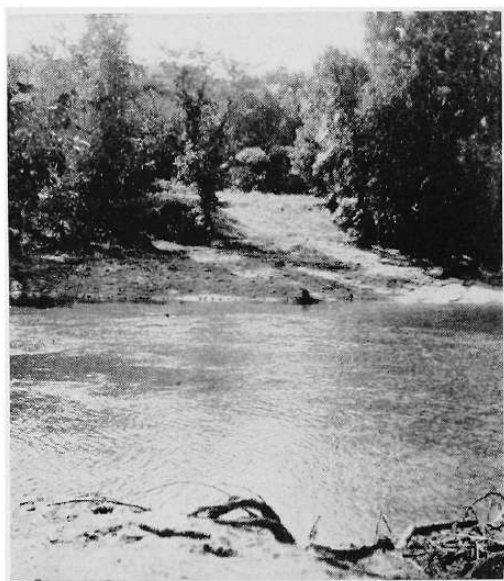
THE site of Redwood Ferry, looking south

He was disemboweled: his head, hands, and feet cut off, and thrust into the cavity. Obscure Frenchman though he was, the blood of no nobler hero dyed the battlefields of Thermopylae or Marathon." 3 Every later version of the story is evidently the result of the impact of that passage on somebody's imagination. Although most of the details apparently were wrong, or at least misleading, practically all proved fruitful for later writers.