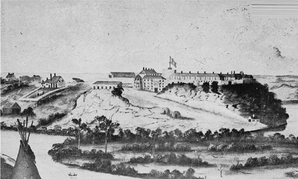
FORT Snelling and the Indian agency, 1852