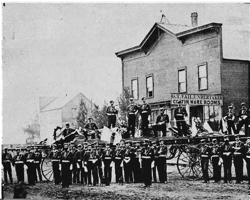
FIRE fighters of the 1860s with hook and ladder