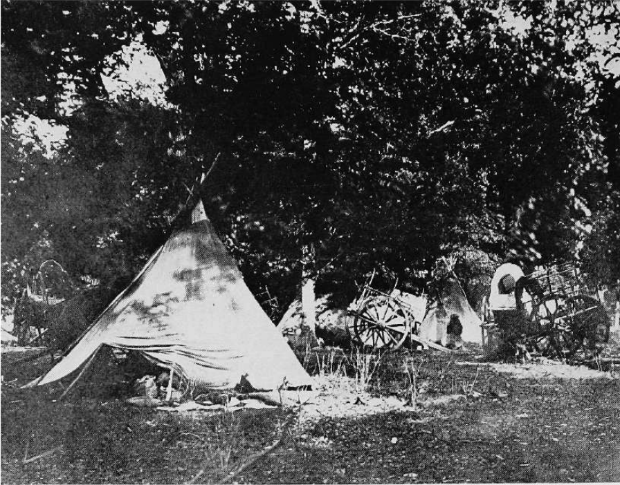
RED River carts near St. Cloud in 1868

parish school would soon expire, and the sisters hoped that the parishioners would then accept them as teachers. Both the nuns and Prior Demetrius counted the days until this plan could be put into operation.