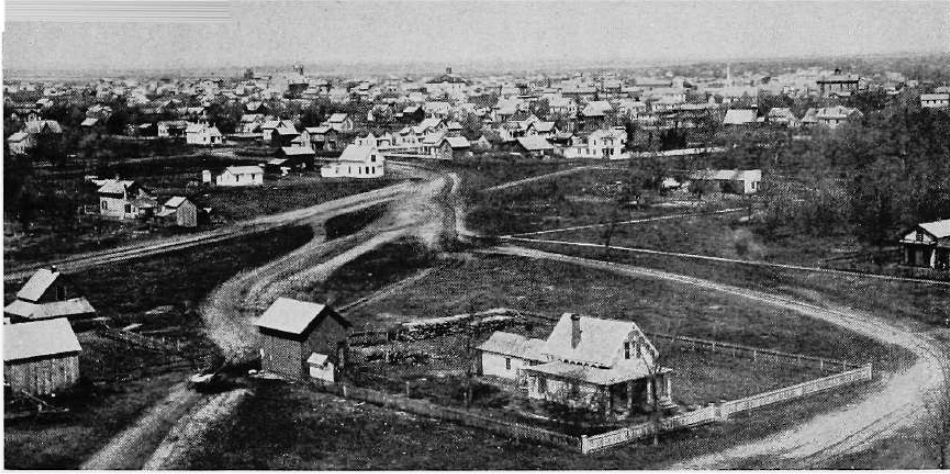
ST. CLOUD in the 1860s

times worried the settlers with untimely visits, and their presence kept outlying farmers on the alert. 7