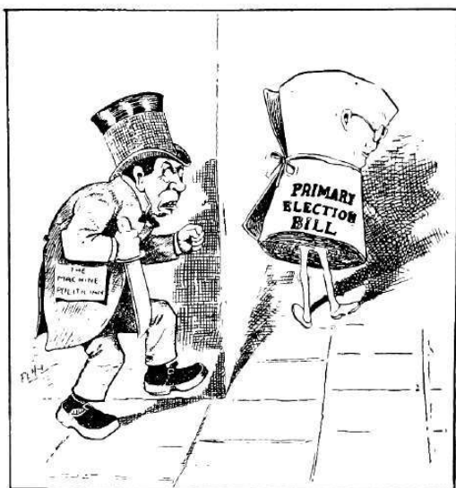
"AWAITING the Opportunity"

tional House of Representatives, the state legislature, and all county and most city officials, but it did not extend to the selection of state officers, who were nominated by political party conventions until 1912, or to United States senators, who were elected by the legislature until that year. 2