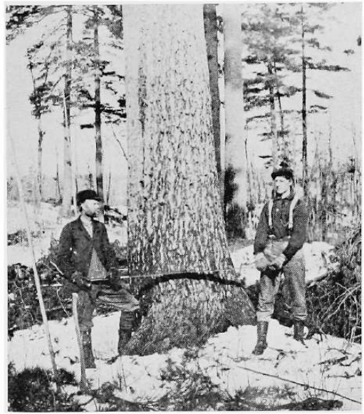
SAWYERS in a Wisconsin camp, 1902

Methods of hiring and paying sometimes tempted transients to leave camp shortly after their arrival. One Wisconsin employer complained that men came to his camp on a Saturday afternoon, only to quit Tuesday morning after having received nine