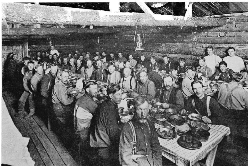
LUMBERJACKS at supper in a Minnesota logging camp, 1913