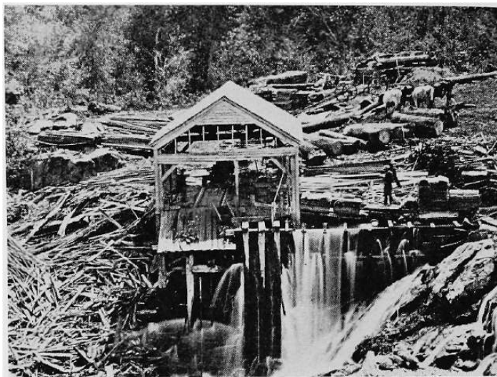
A sawmill at Redwood Falls in 1869 was among those competing for labor

was willing to employ between 1916 and 1924, and it operated with five to nine hundred fewer workers than it needed. 1