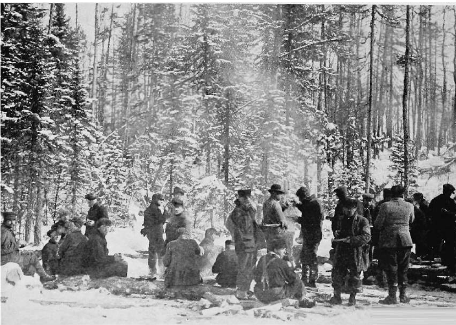
LUMBERJACKS usually ate in the woods at noon