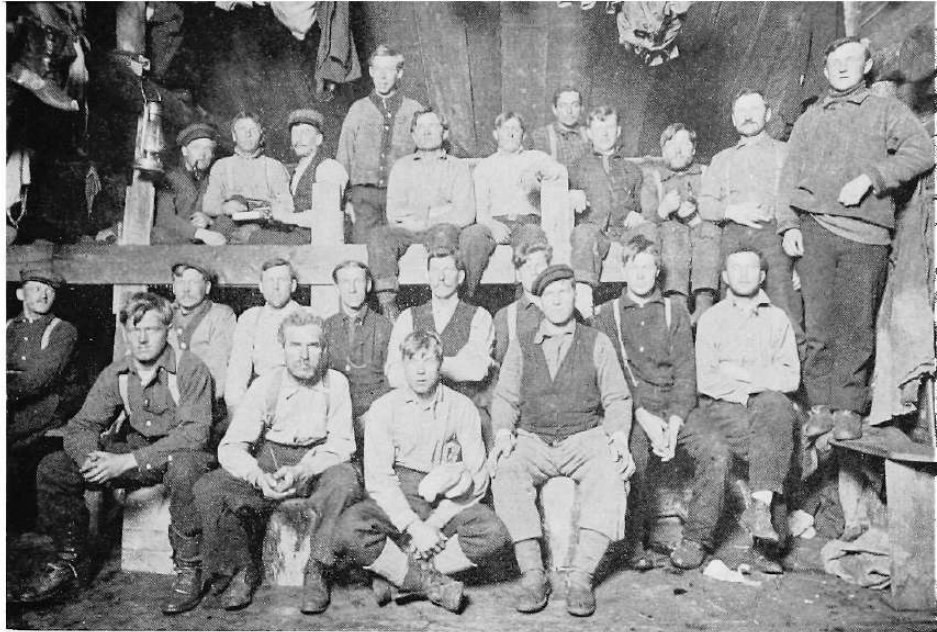
TYPICAL lumberjacks in a bunkhouse