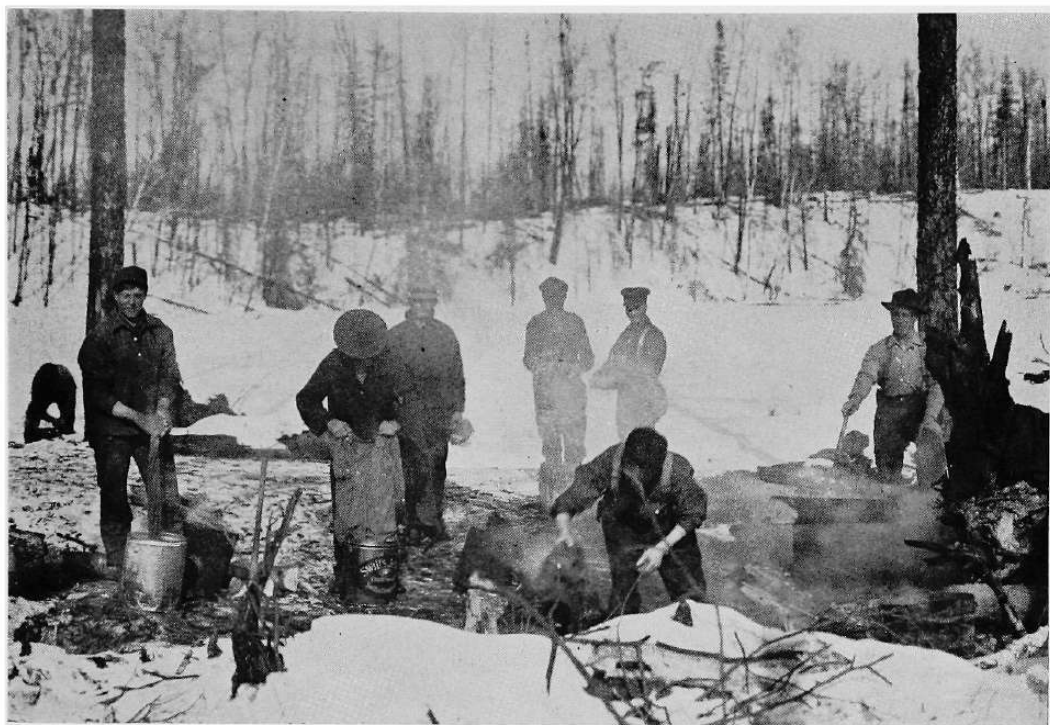
LUMBERJACKS did their own laundry, using water heated over campfires

from applicants and sent them to logging camps which did not need them. Employers occasionally failed to estimate their needs carefully or they sent orders to several agencies and then refused to hire all the men who responded. In some cases there was collusion between employment agencies and logging camp foremen to increase the rate of turnover and the resulting number of fees they could split. Agents who had this objective in view sent men to camps where they were employed only until they had accumulated enough credit to cover agency fees and transportation charges. Then they were fired to make way for members of a new gang who would have a similarly short tenure. 18