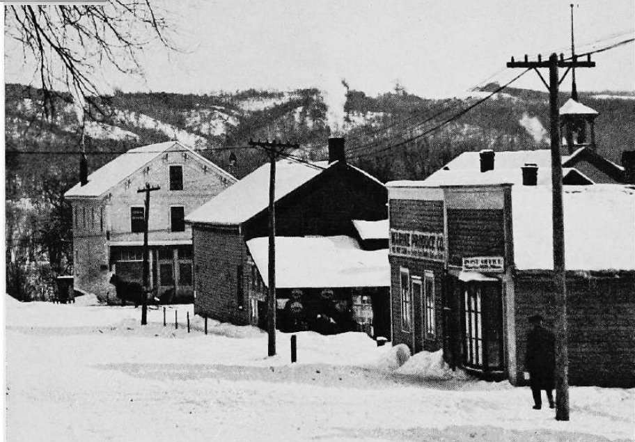
A street in Marine, 1916, showing the post office and the store in which it was located earlier

the Minnesota bank of the stream was rough and almost impassable for wagons in 1849, when E. S. Seymour traveled up the valley and reported that after heavy rains it was even "too miry to travel on horseback." Seymour also tells of seeing one of the semimonthly mails from Stillwater arrive at St. Croix Falls. He was amused by the great excitement it caused as well as by the "exhibition of the genuine democracy of the citizens. The mail matter was emptied out upon a bed, about which all the citizens who were present gathered, and aided in assorting the mail, and selecting their own papers or letters. There seemed to be no distinction between the postmaster and others," he concluded, "as all seemed to be equally engaged in distributing the contents." 10