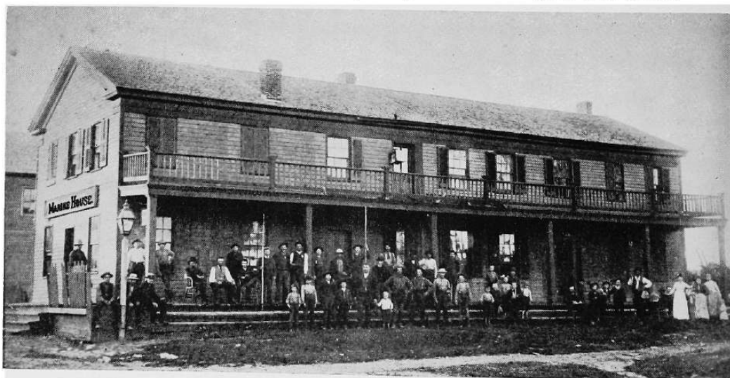
THE hotel in which the Marine Mills post office was housed from 1885 to 1887