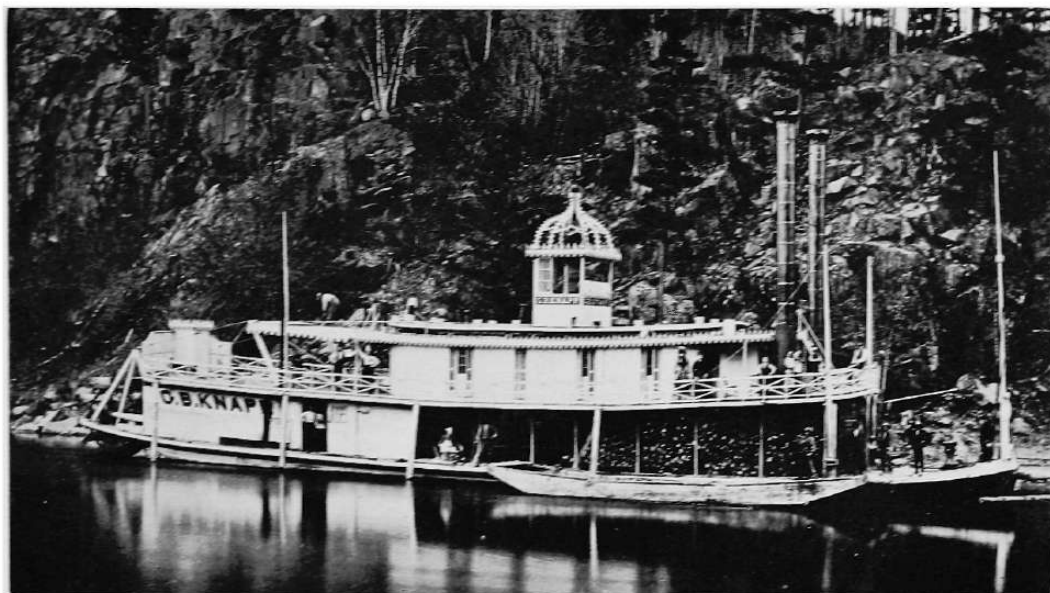
THE "G. B. Knapp," the last mail boat on the St. Croix

In July, 1866, mail service via steamer was discontinued and triweekly delivery by four-horse stage substituted. Valley residents, however, persuaded Congressman Ignatius Donnelly in Washington to have boats reinstated for three days a week; they were to alternate with mail coach trips by land. No evidence showing that this plan was put into operation has been found. Nor do the valley newspapers record another mail boat on the St. Croix until 1871, when the "Wyman X" functioned for a short time after a stage line discontinued service because the road bordering the river was in such poor condition. As the stage driver said: "This road is not passable, not even jackass-able." 21