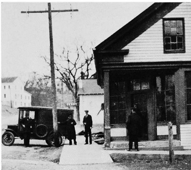
THE village post office at Marine-on-St. Croix in 1929