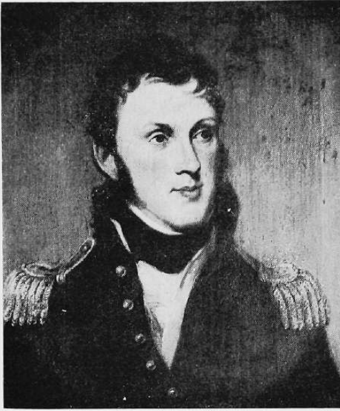
MAJOR Long in 1823

steamboat and revenue cutter to Niagara, thence by canal boat and carriage to Philadelphia. In October, after an absence of six months and a journey of forty-five hundred miles, Keating was back in his home city, where he drew up the account of the exploration, using his own notes and those of Long, Colhoun, and Say. It was published in two volumes in 1824 by H. C. Carey and I. Lea of Philadelphia under the title Narrative of an Expedition to the Source of St. Peter's River, Lake Winnepeek, Lake of the Woods, &c. &c. Performed in the Year 1823 .