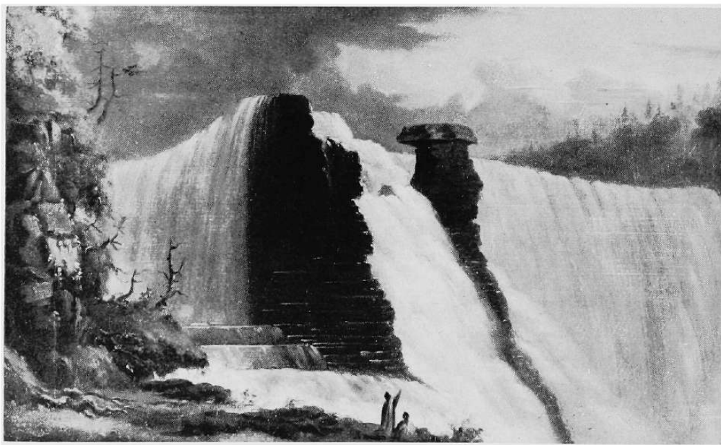
KAKABEKA Falls near Fort William on the Kaministiquia River