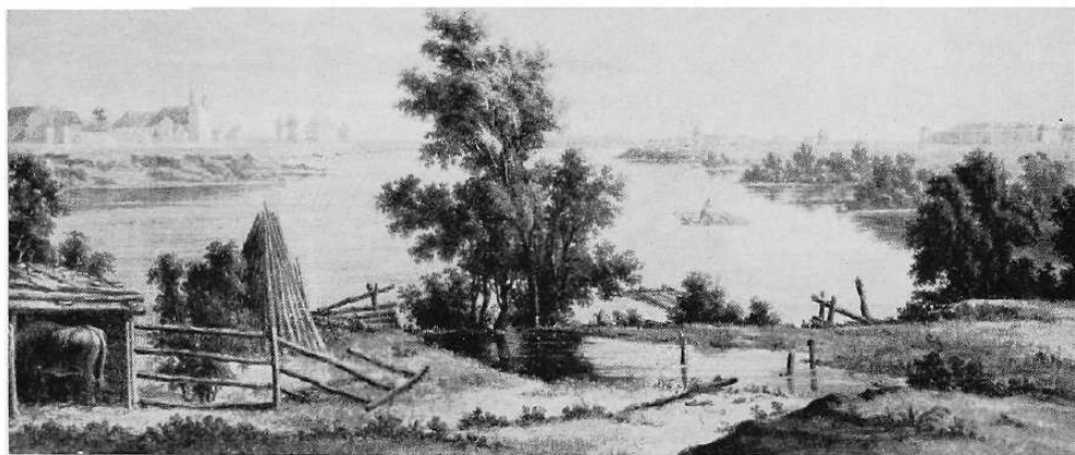
FORT Garry and the Red River Settlement