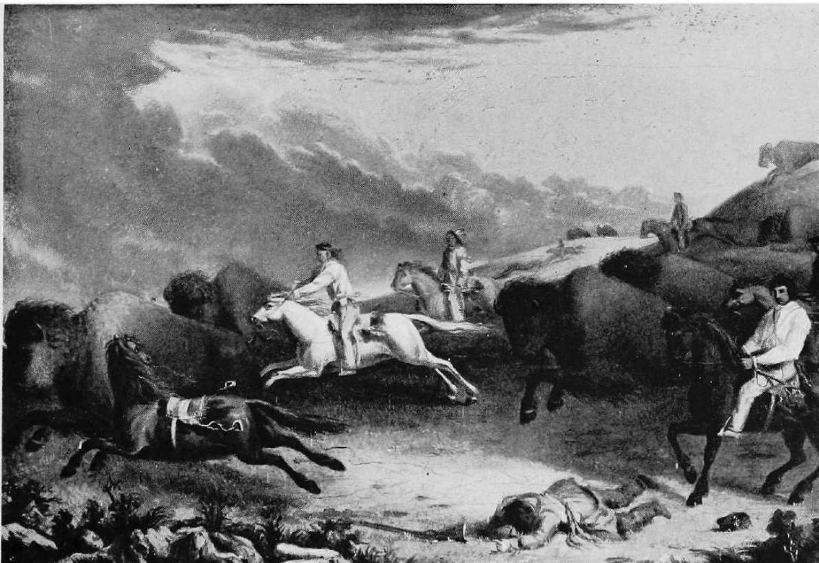
RED River half-breeds attacking a buffalo herd

Kane reports that the "camp was now moved to the field of slaughter for the greater convenience of collecting the meat." Next day the "hunters sighted and chased another large band of bulls, with good success." The encampment and the sur-