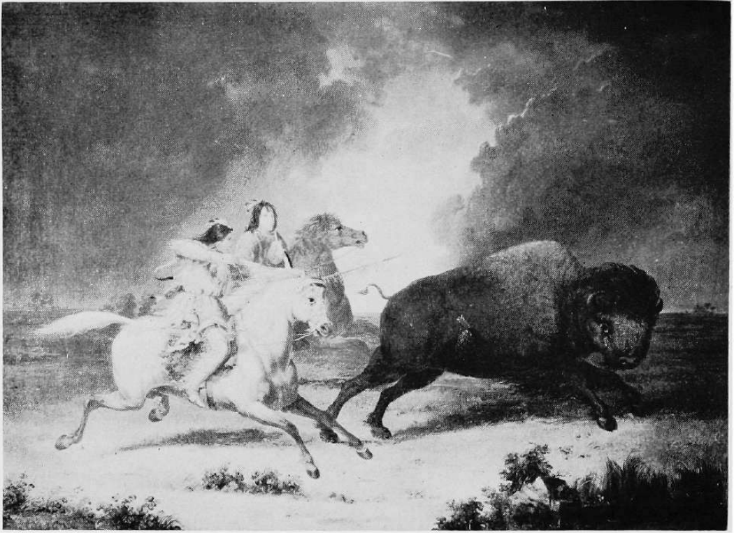
two Assiniboin Indians running a buffalo

always kept in the centre of the herd." So that he could see the buffaloes feeding before the hunt began, Kane set out with a single half-breed early the next morning in advance of the party. They were able to approach within a quarter of a mile of the herd, which they saw "stretched over the plains far as the eye could reach."