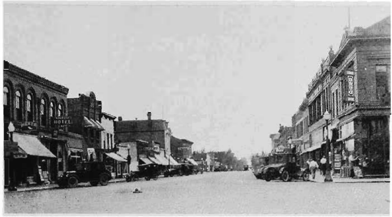
MAIN Street of Sauk Centre in the 1920s

age and youth do not mix well; indeed he is somewhat pathetic as a serious college student. But he conducts himself with dignity, has one or two stimulating experiences, and is content to return to his prairie community without a degree. 20