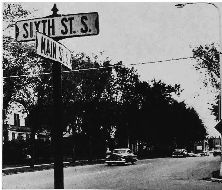
A Main Street view in Sauk Centre, 1957