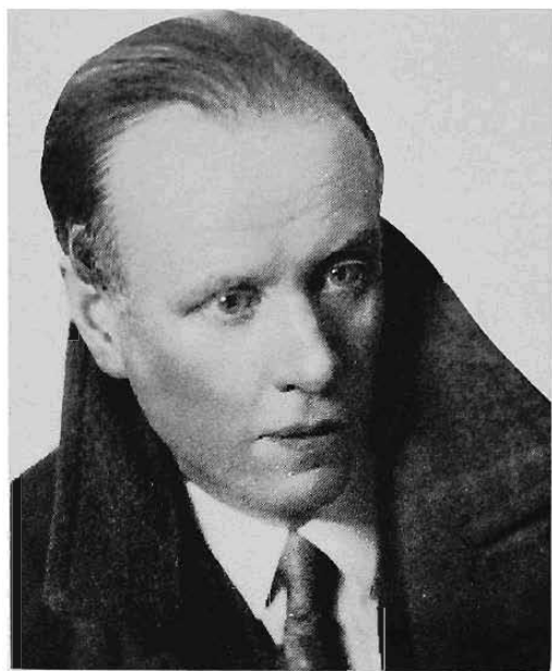
SINCLAIR Lewis in 1933