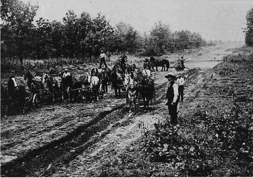
RAILROAD construction between St. Paul and Duluth, about 1869

ing vistas of the forest-sides, create for us behind a constant illusion of castles and villas, which vanish ever as we arrive at their gates. Are they prophetic glimpses of the time when these arched and pillared woods shall be transformed to abodes of cultivated man?