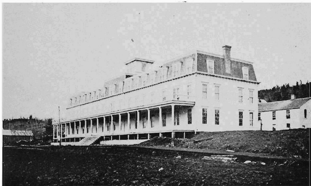
THE Clark House, center for Duluth social life in the 1870s