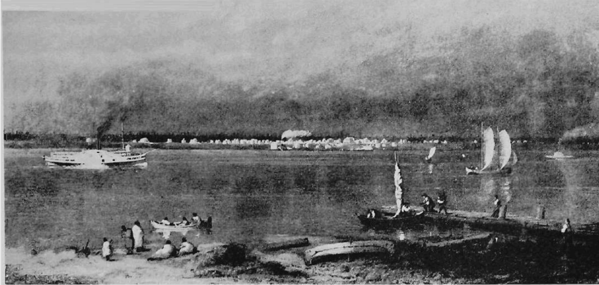
SUPERIOR, Wisconsin, in 1857. From an original charcoal drawing by Eastman Johnson

and the lumber didn't go. It cost me two hundred dollars a year to keep my wharf in repair, exposed, as you see it, to the lake storms, and I never got a cent for it."