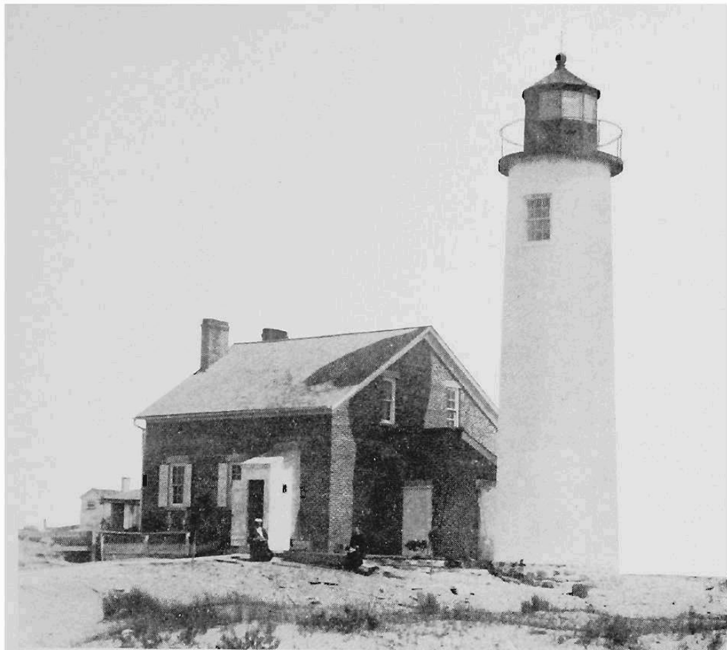
THE lighthouse on Minnesota Point, built in 1858

midst of all which visible preparations for an early influx of trade an astonishing quiet reigns. There are unfinished roofs and open house-sides all round us, yet not a sound is heard.