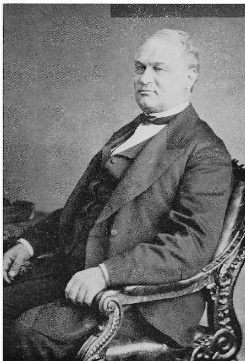
ALEXANDER Ramsey in the early 1860s

“WHEREAS, The Government of the United States, in the due enforcement of the laws, has for several months past been resisted