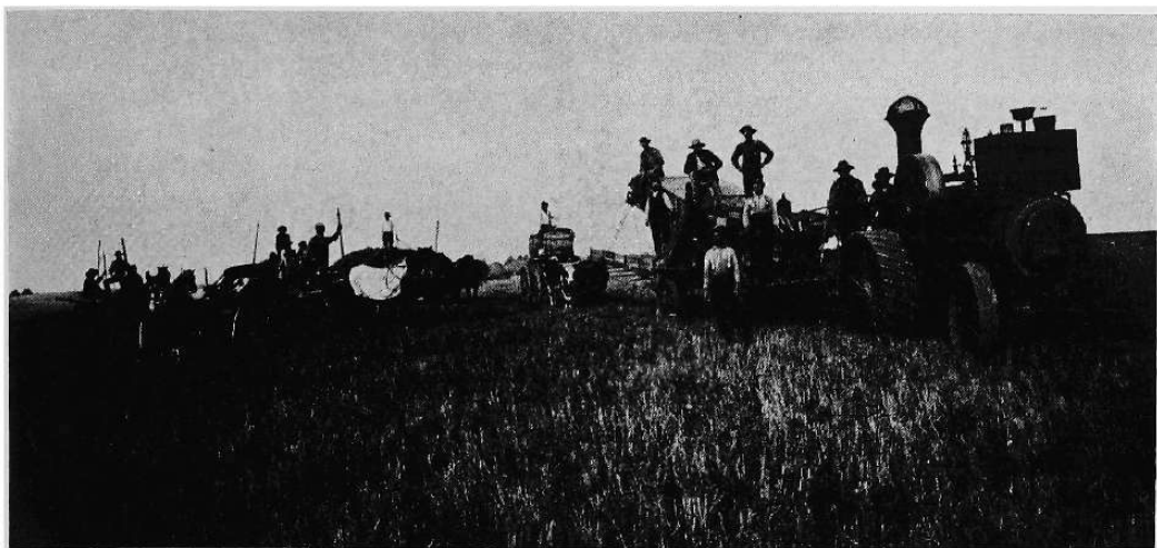
WORKERS on a bonanza farm in Norman County, probably in the 1880s

There were no holidays. Sunday was the same as Monday. We could accomplish nothing when it rained, however, so on rainy days we would pass the time playing casino, chatting, or sleeping.