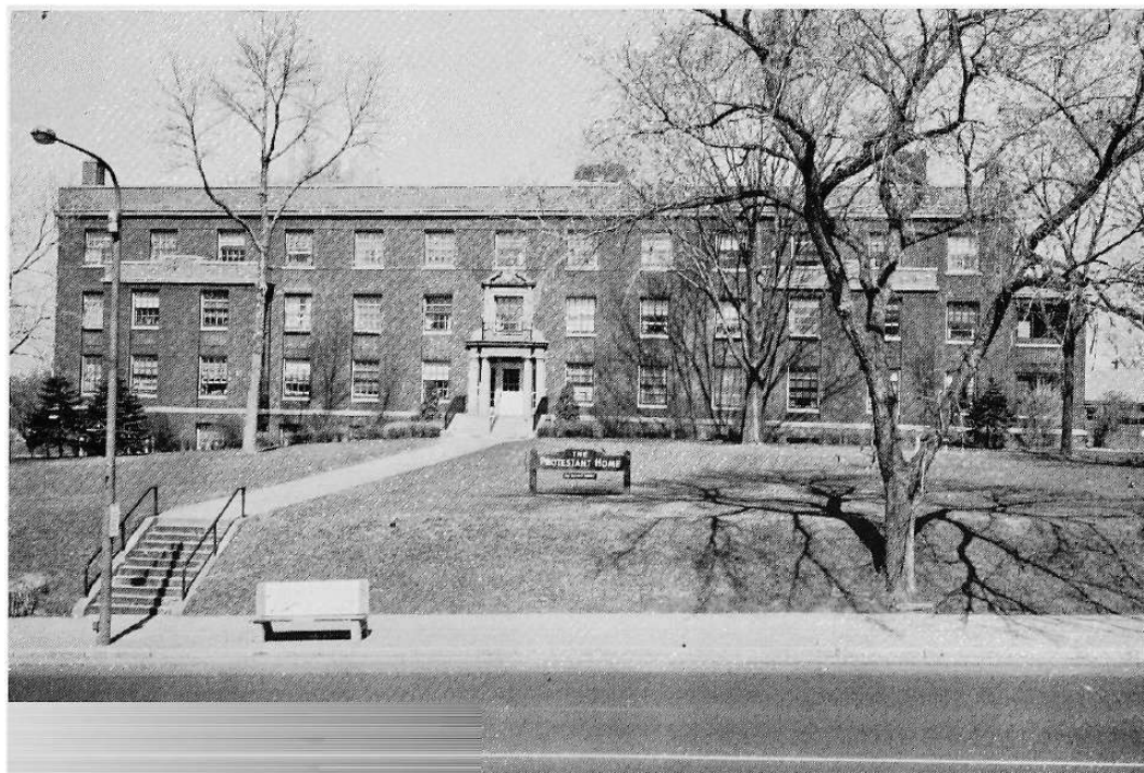
A view of the Protestant Home at 753 East Seventh Street, April, 1962

name was changed to the Protestant Home of St. Paul. The term "inmate" has given way to that of "resident," although now, as earlier, the term more commonly used is simply "our family." There has been a change in admission policies. The fee for life membership was raised to $1,000, then to $2,000, and finally abolished altogether in line with the more realistic system of monthly rates. In 1960 the articles of incorporation were amended, and at that time the board of managers became the board of directors. 44 To be eligible for election to the board a person must still be a member of a Protestant congregation. Many directors are daughters, daughters-in-law, or granddaughters of the women who served in earlier years. No longer do they sally forth in hoop skirts and bonnets to visit the home of a child they have placed, or travel from office to office to solicit the materials for a cow barn. They still, however, take turns as visiting directors, calling on the residents and helping to solve some of the problems that arise. And, as at that first meeting in the vestry of the old First Presbyterian Church some ninety-five years ago, they are trying to determine what further need St. Paul may have, so that when the time comes they can work to meet it.