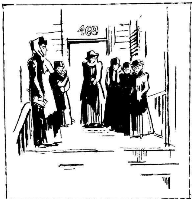
INMATES leaving the home on November 15, 1915, sketched from a photograph in the St. Paul Dispatch

elderly lady was allowed one small suitcase, and the writer said that the women had to discard "old photographs . . . 'comfy' old slippers and the favorite cap" as they sat on their bulging suitcases to make them close. "'When I come back' was the phrase which kept all the departing ones from feeling too badly as they donned their bonnets and capes and put the last of their belongings in grips. . . . Whether they do come back," continued the article, "depends on St. Paul raising $15,000 to complete the $35,000 fund necessary to erect a new building which will meet the approval of the building inspectors and insure comfort and safety to the aged inmates."