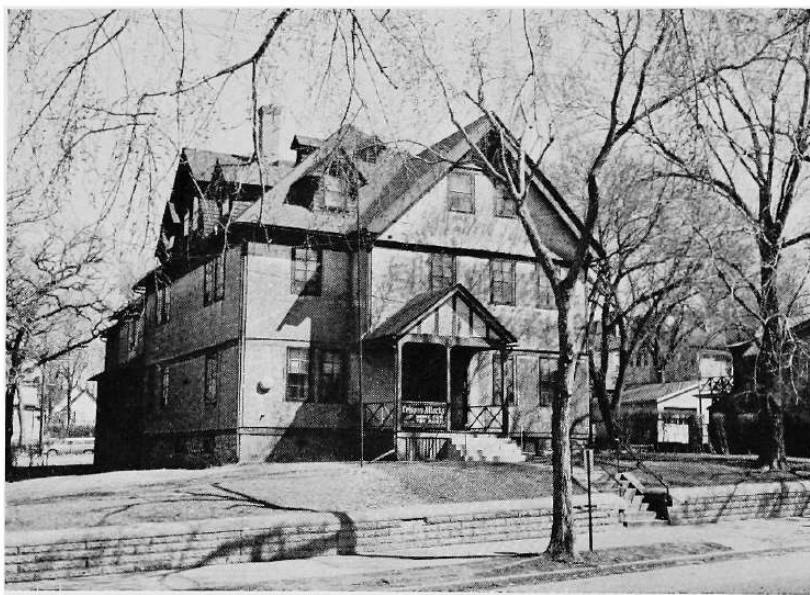
THE building at 469 Collins Street in April, 1962