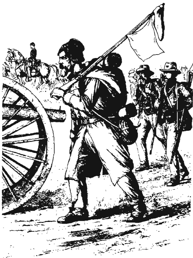
A Union soldier hangs out his washing while on the march

over the heaving pontoons across the storm-swept river.” 9