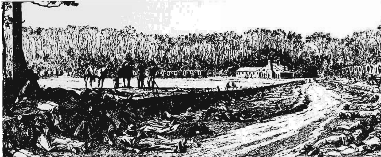
A column of Union soldiers halted for a rest during a long march

experience and many men wilted in the scorching heat and dust like mown grass. . . . There were a number of cases of fatal sunstroke, and some dying almost as quickly as if struck by a bullet in a vital part. All of the ambulances were filled with helpless men and those left behind were coming in all of the first part of the night.” 3