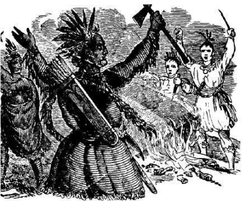
Jeff. Davis's Allies in his savage Rebellion!