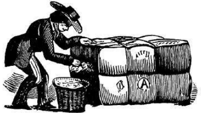
The Quartermaster desling out the Allowance.

Army Rations of the Southern Confederacy.