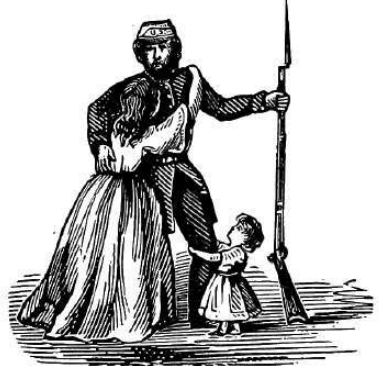
The Union Volunteer leaving his "Old Arms" for the "New Minnie."