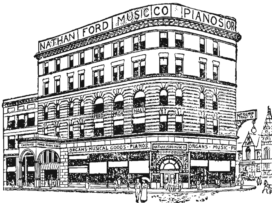
THE building at Sixth, St. Peter, and Market streets

sicians found it difficult to repay the sizeable sums borrowed. 13