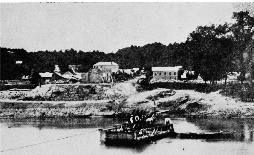
THE ferry to the new town of Henderson, 1854