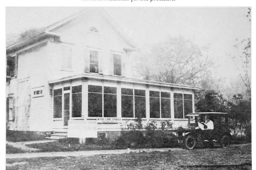
The ten-room house on the Augsburg Park property which was scheduled to become "an ideal residence for the president"

ALTHOUGH students picnicked occasionally at "Augsburg's future home" following these events, interest in Augsburg Park faded. Memorial Hall, a substantial four-