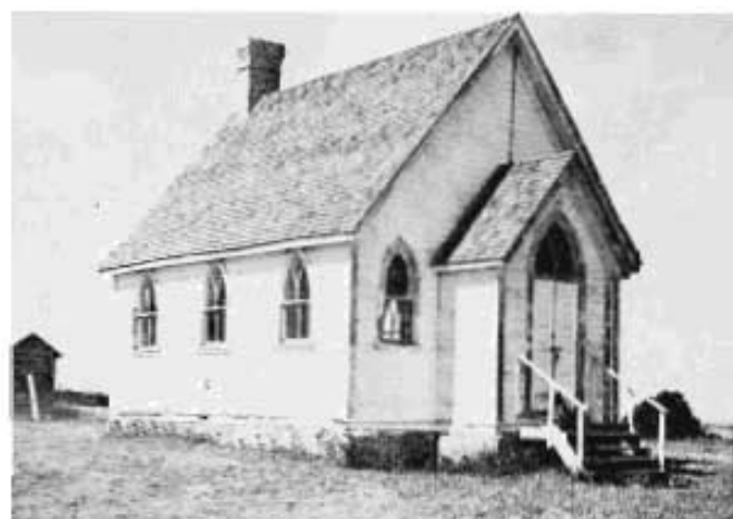
This Presbyterian church is on the Birdtail Creek reserve at Beulah, Manitoba.

Neither band was in a hurry to settle down. For several years it was hard to get an accurate census at Standing Buffalo because the Indians were seldom all there at one time and because they objected to being counted. White Cap spent most of his time off his reserve, sometimes at Prince Albert, sometimes as far away as the Cypress Hills, in extreme southwestern Saskatchewan. Life at Moose Woods was hard for those who did stay. The surveyor who visited the reserve in 1880 said that in the previous three years forty Indians had died and the survivors were mostly elderly people. The agent reported that when he arrived there in May, 1881, he found many destitute, and three or four who had died were mere skeletons. He helped the Indians plant a small crop and built eight houses. 24