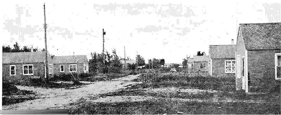
A dirt street in "Sioux Village" at Portage la Prairie, Manitoba