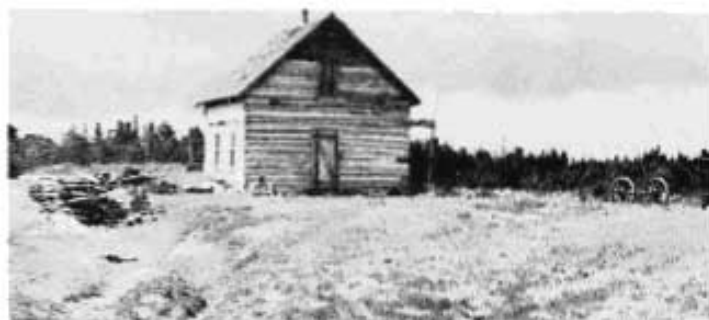
Unoccupied house on the bleak Wahpaton Sioux reserve north of Prince Albert, Saskatchewan

gression, marked neither by spectacular improvement nor by noticeable retrogression.