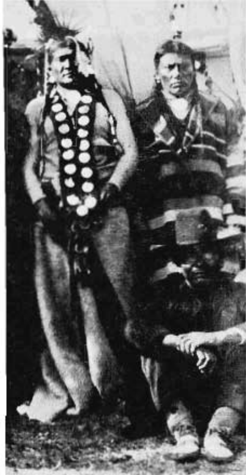
Early photograph taken on one of the Canadian Sioux reserves

were taken to select a reserve for them. About a year later a school was opened under Presbyterian sponsorship. 35