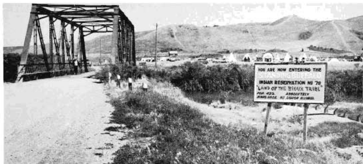
Entrance to Standing Buffalo reserve, Fort Qu'Appelle, Saskatchewan

in present-day Saskatchewan. When two commissioners appointed to treat with the plains tribes met with White Cap in 1875, he told them that his people had been in the Qu'Appelle region for thirteen years and wished to be left as they were, with the privilege of hunting with the métis, and did not want to settle on a reserve with the other Sioux. 20