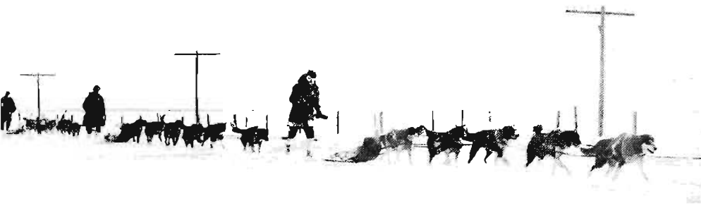
LE PAS DRIVERS and their teams bunched together near Elk River as the temperature dropped to twenty-five degrees below zero. 24