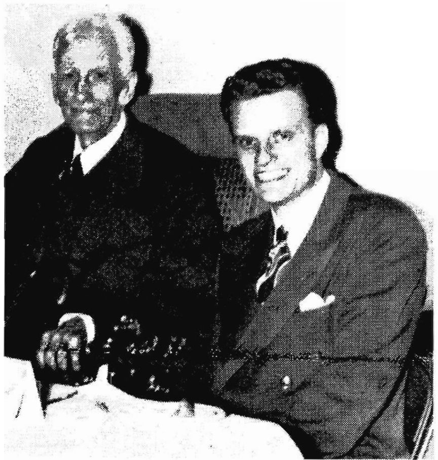
YOUTHFUL Billy Graham sat with the aged Riley about the time he became head of Riley's Northwestern Schools.

dividuals with strong Baptist connections. Literally hundreds wanted to learn to be evangelists like Graham. When he left there was no comparable charismatic figure to draw such young people.