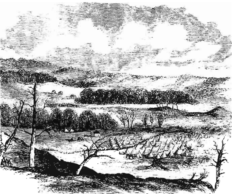
ENTITLED "Indian Camp at Red Wood," this drawing shows the Lower Agency area as it looked in the 1860s.