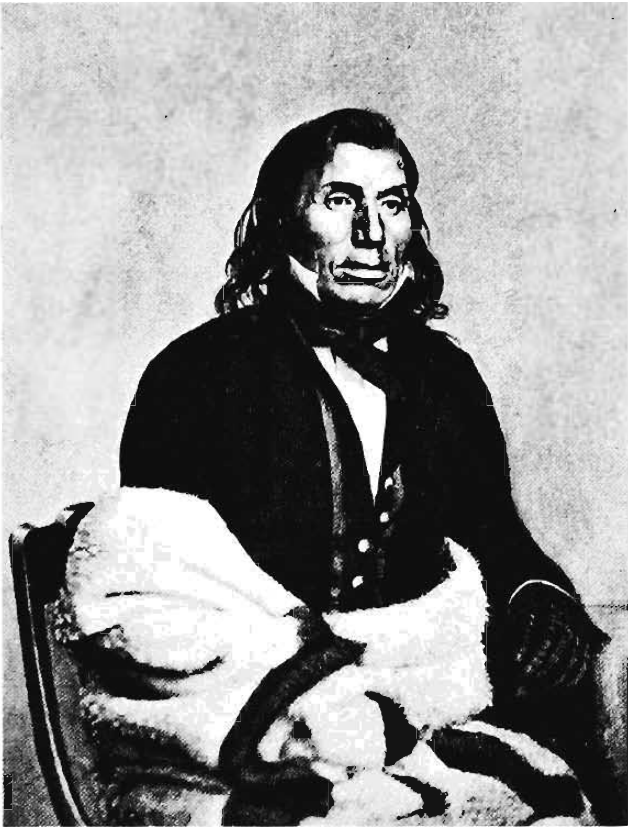
LITTLE CROW as photographed by Joel E. Whitney

of 1862, mainly because variation from his recorded pattern would reflect the flexible aspects of sociopolitical organization at the Mdewakanton band level.