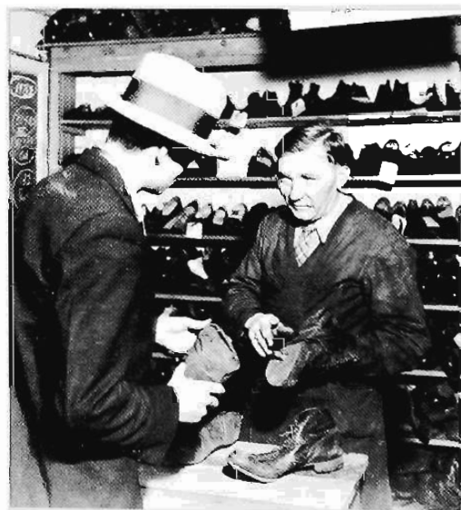
SALVAGING OLD SHOES in the repair shop provided people with work and saved the customer, at least temporarily, the cost of new shoes.