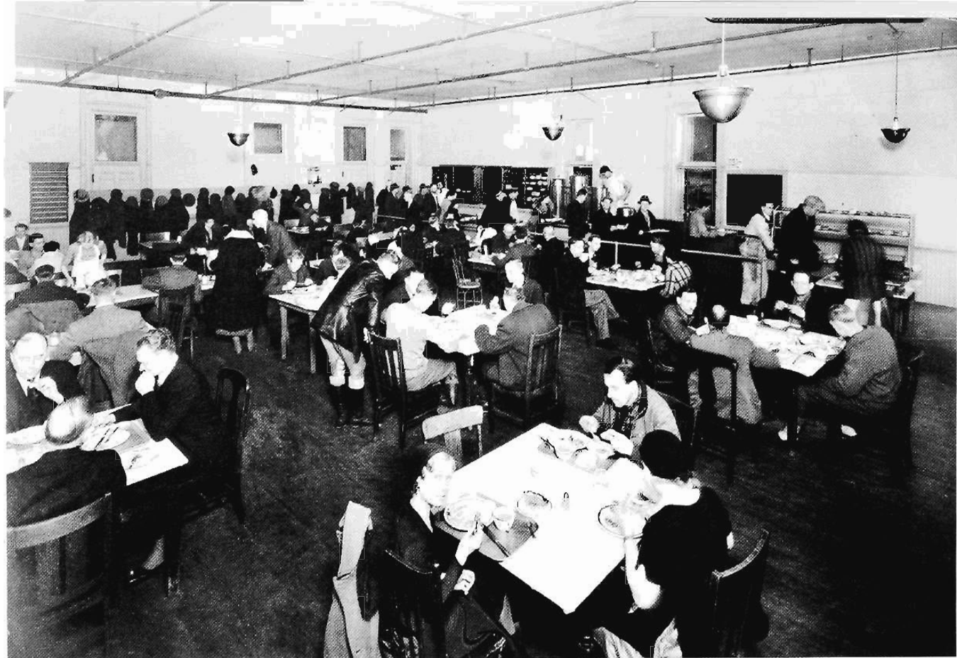
THE "WHITE COLLAR RESTAURANT" was in the Girls' Vocational School. It had a staff of forty and served as many as 1,400 meals per day at ten cents a meal.

Members threatened with mortgage foreclosure or eviction for nonpayment of rent were helped through a department staffed by sixteen attorneys who donated their services. The department claimed to have saved hundreds of families from eviction or property loss through conferences with landlords or mortgage holders. 22