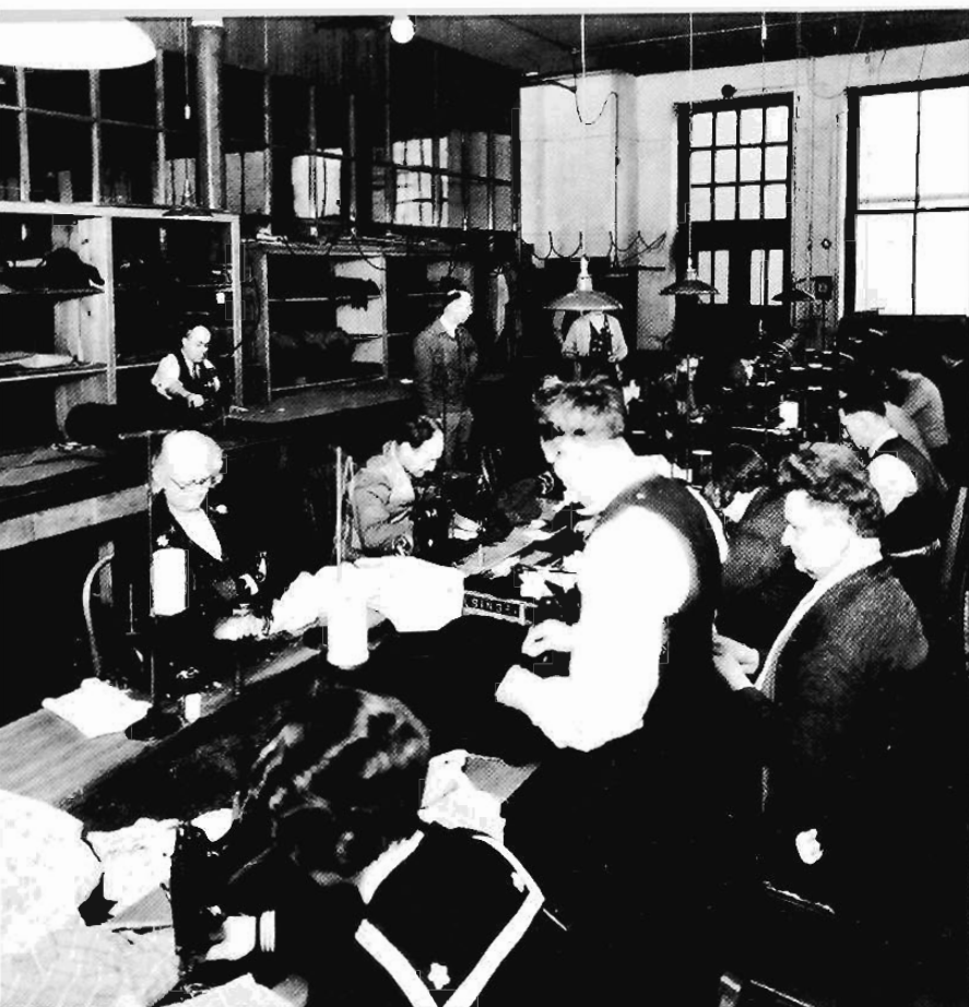
HEAVY MACKINAW coats and warm flannel garments for men, women, and children were made in the clothing department. Material was obtained by barter and exchange. Later the OU contracted with a manufacturer to make his clothing as well as its own in exchange for the use of equipment and raw materials.