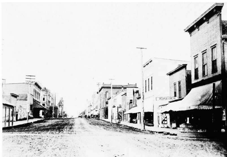
CROOKSTON, with its unpaved streets and wooden sidewalks, looked about like this to Twain when he visited it in 1895. This view looks southwest from the corner of Second Street.

MARK TWAIN was the first guest to stay at the Hotel Crookston, although it did not officially open until July 31. Sumptuous ceremonies, including visits by such dignitaries as Minnesota's governor, marked that event. A reporter for the Crookston Times who looked through the hotel's "elegant interior" predicted that "it will be far the finest hotel building in the northwest" and "will stand for a century." The hotel is no longer standing.