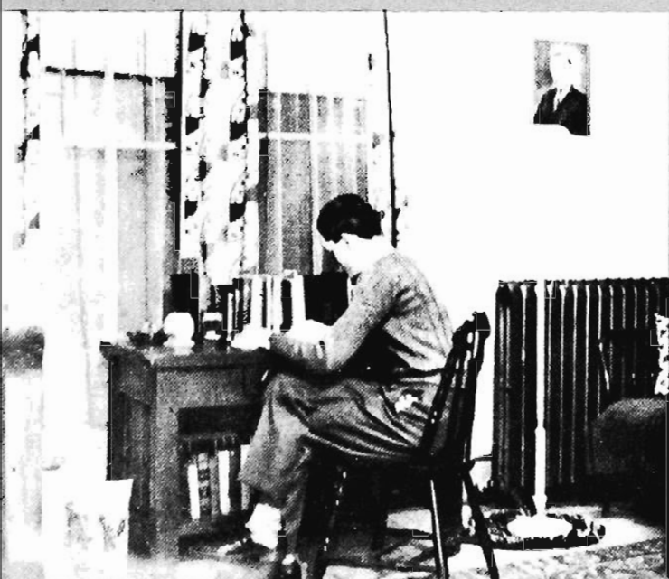
AS A STUDENT at the university in 1938, Humphrey often read late at his desk. Note the photograph of his hero, Franklin Delano Roosevelt, on the wall. Already an orator while at Minnesota, Humphrey is shown (right) speaking at a university event.