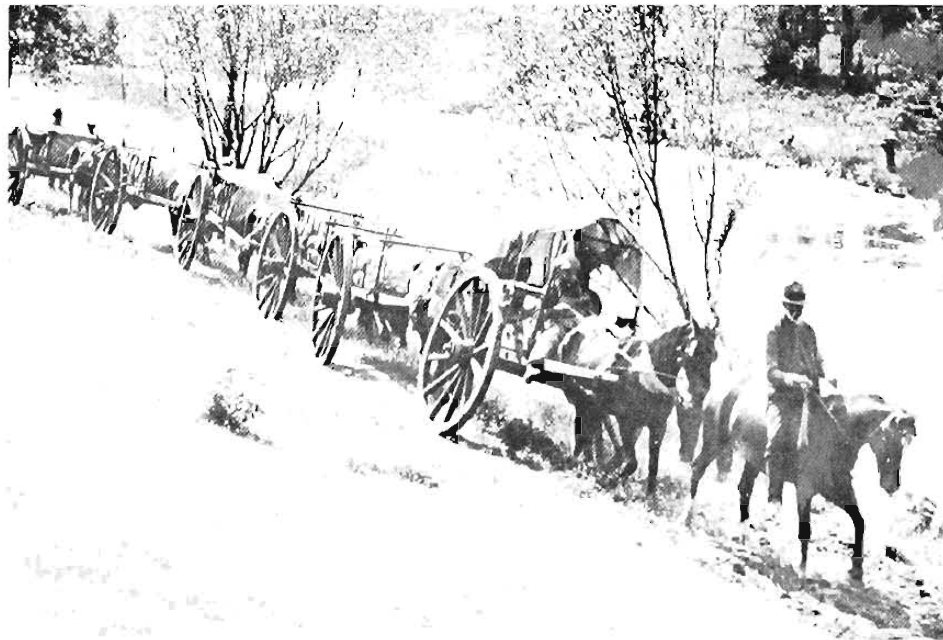
A TRAIN OF OXCARTS travels along what are said to be the banks of the Red River. The date is not known.