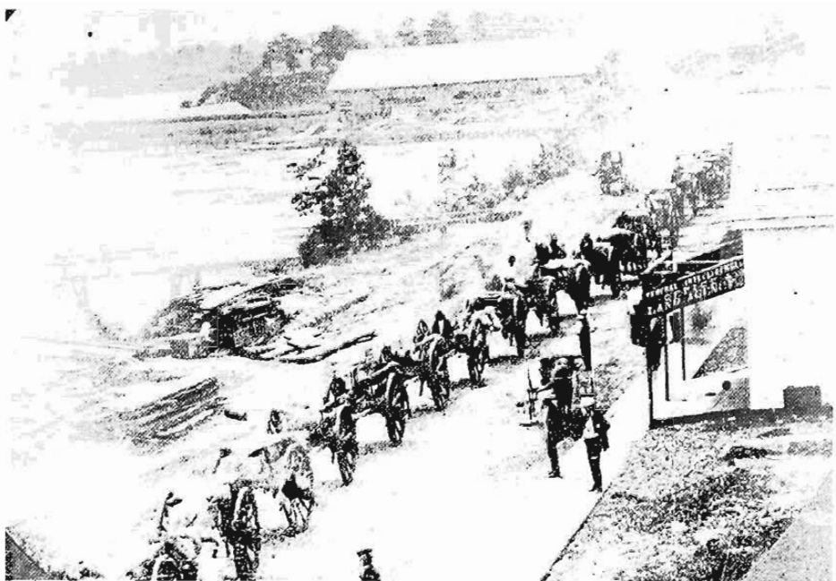
A TRAIN OF OXCARTS passes through the town of St. Anthony in 1855.

nineteenth-century journalists, but, like most clichés, it had a source in truth. The mixed-blood scions of the fur trade whose ancestors had crossed the waterways of the continent in frail birch-bark canoes were not unaware of the similarities. The French voyageur's vocabulary of inland water travel was transplanted to the plains and flourished there, though travel was done by oxcart and pony rather than by paddle and canoe.