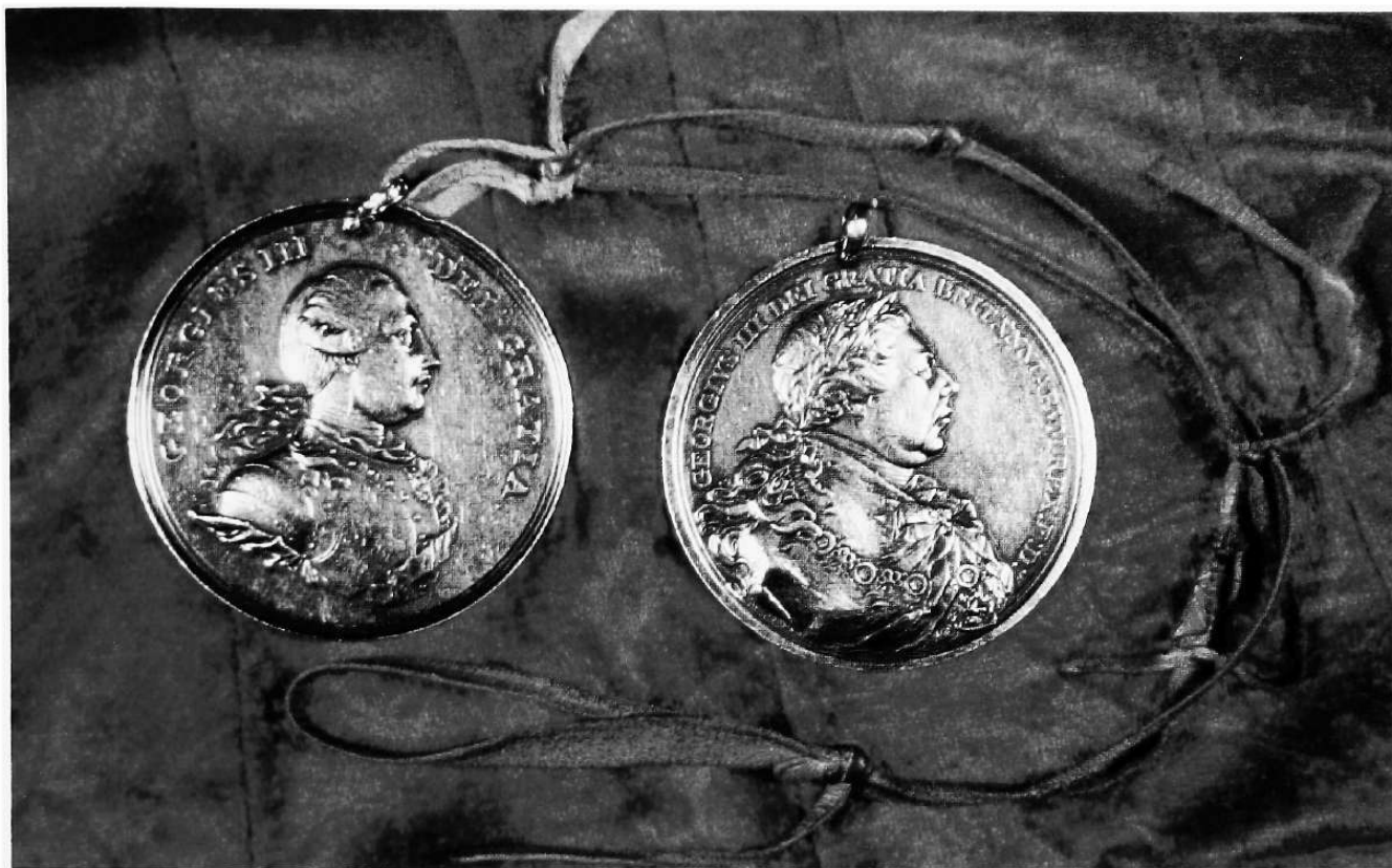
HERE ARE the two British silver peace medals, each about three inches in diameter, that the Flatte family presented to the Minnesota Historical Society. King George III aged considerably in the thirty years or so between the earlier medal (above, left) and the other, dated 1814. On the reverse sides (below) the coat of arms changed, too. The earlier medal is at left.