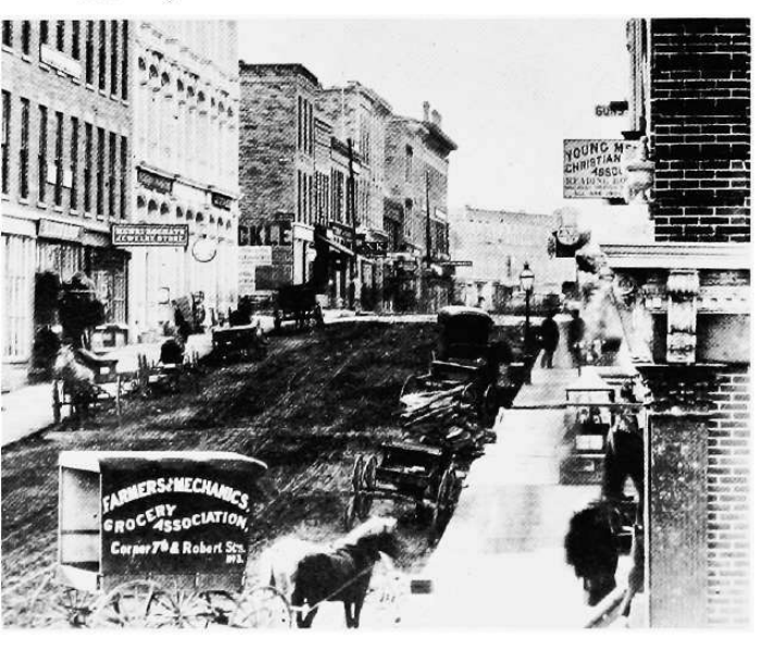
THIRD STREET, looking west from Minnesota Street to Wabasha, in 1873

Moreover, members of the wider community disagreed about the appropriate policy toward vice. Some wanted it eradicated; others, believing vice to be harmless or inevitable, advocated legalization or regulation. During the years after the Civil War, St. Paul's city officials, as well as ordinary citizens, frequently debated vice policy without reaching a consensus. As a consequence, police were frequently criticized for their enforcement of vice laws.