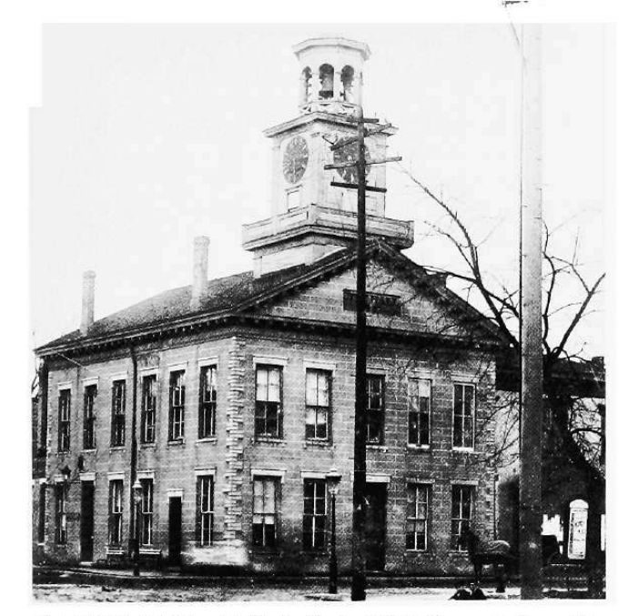
ST. PAUL'S City Hall, built in 1856, housed the police department (1891 photo).

adopt the license system. It is an evil that must be looked in the face, and not handled with kid gloves." ^{16}