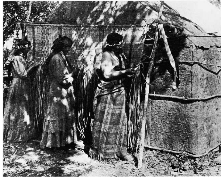
WEAVING patterns into a rush mat in the shade of a bark lodge, about 1900

Scattered references in the historical record on the role of women in the Ojibway subsistence economy noted with some frequency that women did a great deal of the hard and heavy work. Some observers began to fashion an image of the women as burden bearers, drudges, and virtual slaves to men, doing much of the work but being barred from participation in the seemingly more important and flamboyant world of male hunters, chiefs, and warriors. This image is fostered in the published work of the Reverend Peter Jones, a Mis-