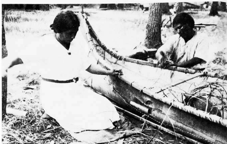
A COUPLE shared the job of sewing canoe gunwales with spruce root at Mille Lacs, about 1940.

LIKE MANY if not most cultures throughout the world, the Ojibway believed that certain tasks were more appropriate for men and others for women. Hunting and trapping, for example, were ideally the male domain, and first-kill feasts honored only boys for their role as hunters. Gathering wild plant foods and gardening, on the other hand, belonged to the female domain. Yet to a large extent, domains overlapped, so that women and men often worked together, having separate duties in the same general activity. In canoe building, for exam-