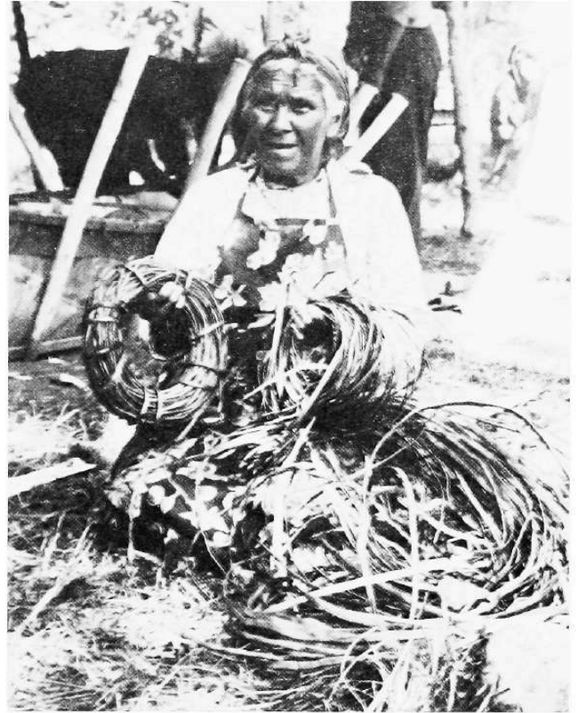
A GRANDMOTHER posed about 1940 with rolls of split spruce roots for lashing birch bark to canoes.

IN THE SEASONAL round of family life, women were primarily responsible for building the lodges. Female family members often worked together to construct a winter wigwam. They cut saplings from the woods to form the lodge frame, covered it with rolled sheets of birch bark sewn together and with woven rush mats made anew each fall. Together, the women could construct a comfortable and inviting winter dwelling in a matter of a few hours. They not only built the lodges but were also considered to be the owners of the lodge and managers of the activities that took place in and around it. Schoolcraft spoke of women as household heads when he noted, "The lodge itself, with all its arrangements, is the precinct of the rule and government of the wife. She assigns each member, his or her ordinary place to sleep and put their effects. The husband has no voice in