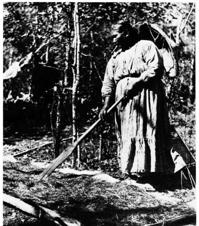
PARCHING wild rice on birch-bark sheets at White Earth Reservation, about 1910

sasauga Ojibway and Christian missionary to his people in western Ontario during the mid-19th century. "In accordance with the custom of all pagan nations," he stated, "the Indian men look upon their women as an inferior race of beings, created for their use and convenience. They therefore tend to treat them as menials, and impose on them all the drudgeries of a savage life, such as making the wigwam, providing fuel, planting and hoeing the Indian corn or maize, fetching the venison