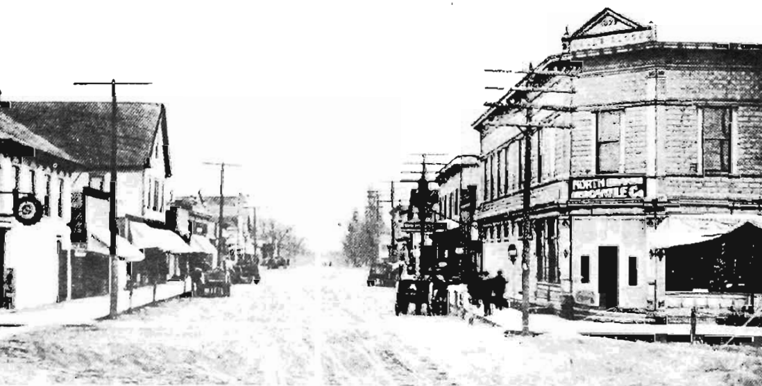
A DUSTY view of Main Street in North Branch, photographed by Bloom Brothers of Minneapolis for the North Branch Mercantile Company, about 1910