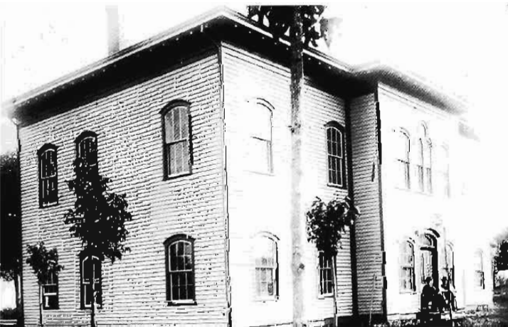
THE CHISAGO County Courthouse, about 1880