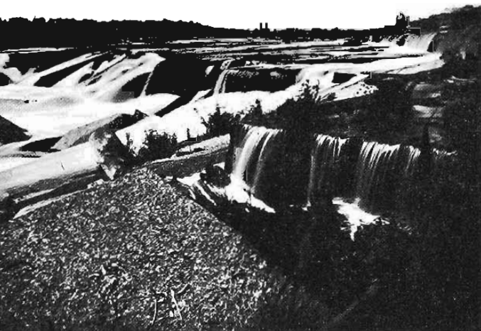
THIS VIEW of the Falls of St. Anthony in 1860 looks toward the young city of Minneapolis and the suspension bridge in the distance.

Presumably this sheet was once as horizontal as the entire limestone formation to which it belongs. Water likely washed away very evenly the underlying sand-