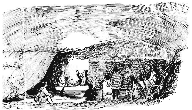
CARVER'S CAVE in 1867 during observance of the centennial of its discovery; sketch by R. O. Sweeney.

As usual the elevation of these mounds offers another gorgeous view of the countryside. At our feet: the Mississippi; to one side: St. Paul's friendly and attrac-