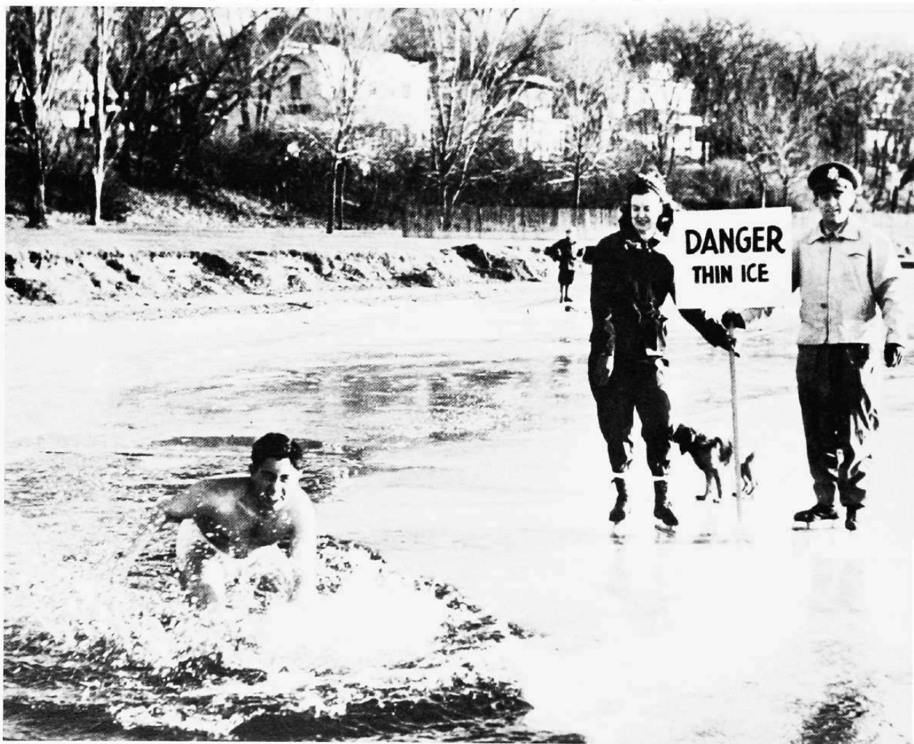
A CHICAGO newspaper's perception of Minnesota as a theater of seasons, photographed in 1944