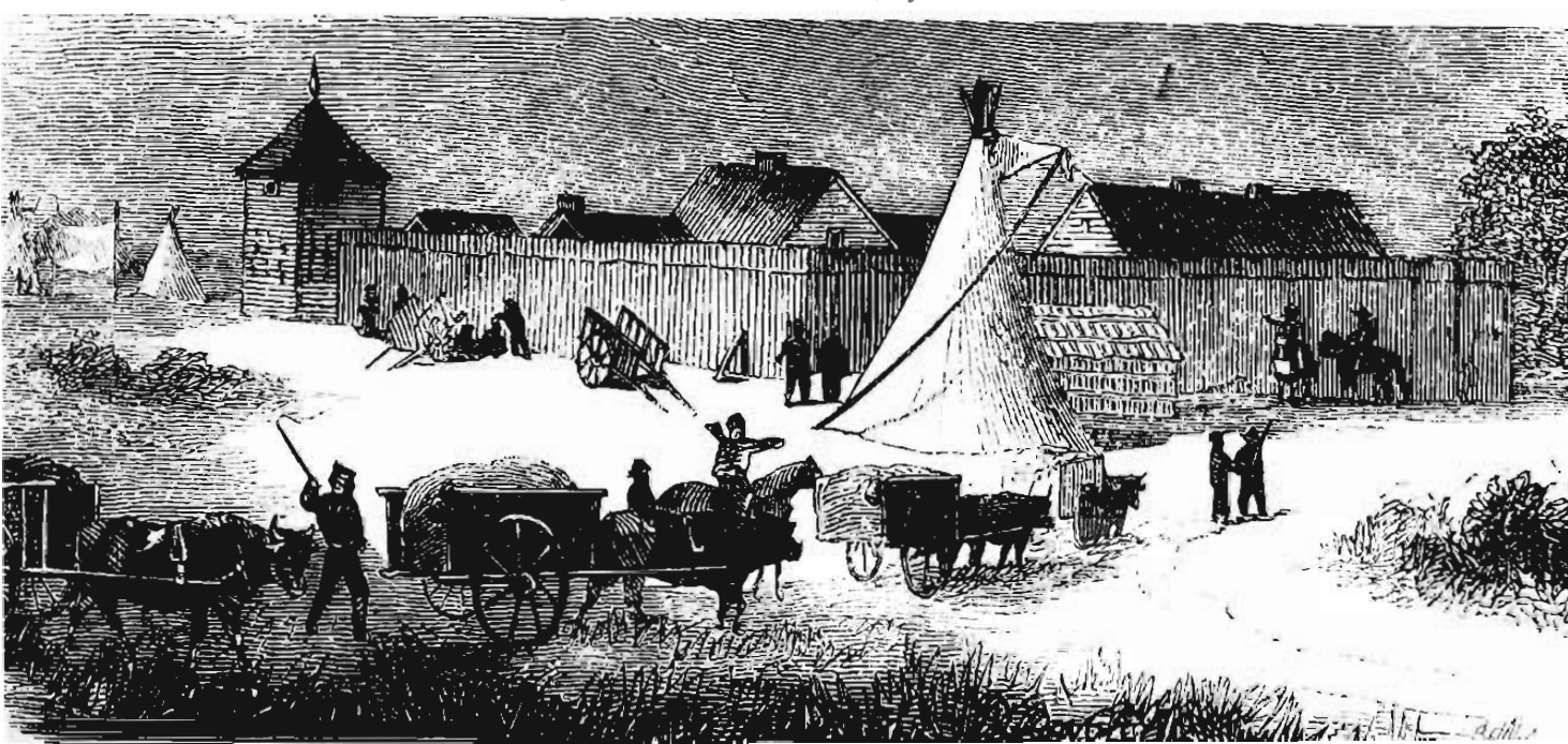
A CART TRAIN approaches a Pembina fort in this artist's drawing of about 1860

The Icelanders and other newcomers flooding into the area probably paid little attention. As far as they were concerned, a boom was on. The population of