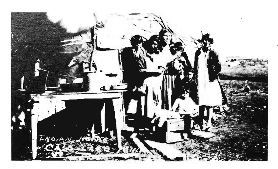
A LATE example from the 1930s of a locally issued card depicting the Ojibway in an indigenous setting

turing Ojibway in their daily dress and in indigenous settings, especially summer encampments, sugar camps, wild ricing areas, and local celebrations, remained popular until about 1935. Backgrounds were neutral, except when pictures were taken at an indigenous campsite where a bark tepee or wigwam stood prominently in the background. The style of posing remained unpretentious as well. After 1935, however, those cards increasingly resembled the ones produced by regional companies.