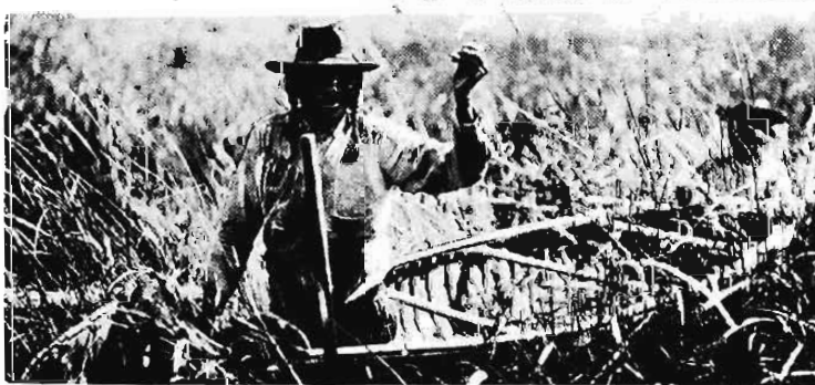
AN EARLY lithograph, "Gathering Wild Rice. Turtle River, Cass Lake, Minn.," by Bloom Brothers Co., Minneapolis, around 1910

ANOTHER scene from everyday life (right). probably taken in Onamia