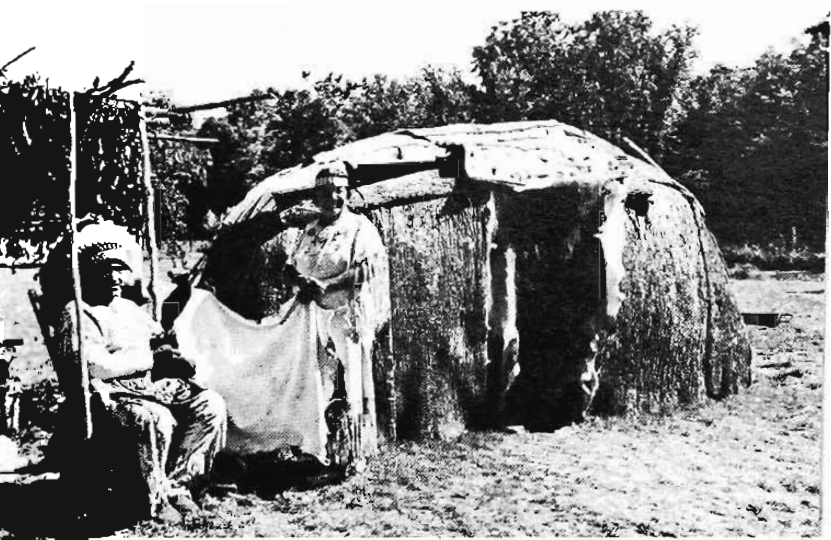
OJIBWAY outfitted in a mixture of ethnic dress in this picture (above) taken in the early 1960s at Fort Mille Lacs Indian Village