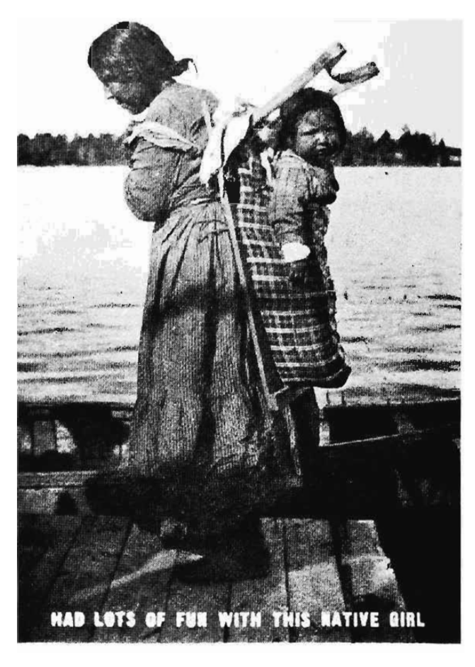
CLEAR LAKE, MANITOBA. CANADA

The Ojibway were often major subjects in the post cards produced and sold in those areas of Minnesota where they lived. One of the first things that strikes the observer of these early cards is their ordinary quality. The Ojibway are pictured in their everyday dress,