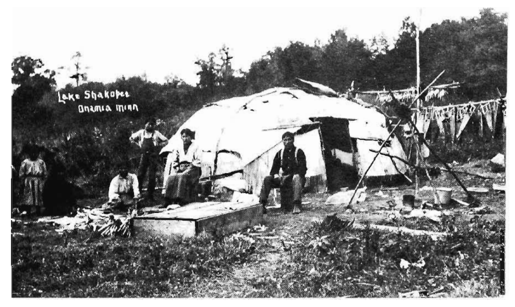
A COMMON early post card view portraying an aspect of everyday life

DURING the first two decades of the 20th century, many privately made photographs were printed on post card stock. Studio photographers often issued their work on post cards, and people who owned cameras sometimes had their photographs printed on this medium as well.<sup>7</sup> Many of the early 20th-century photographs that Indian people had taken of themselves