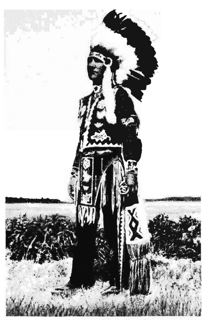
ONE of the popular Curteich Indian Scenes series

highly caricatured and stereotyped fashion gradually replaced locally taken authentic pictures. Many factors influenced the change, but a major one was the rise of tourism, which was rapidly becoming a dominant industry in northern areas of Minnesota, replacing lumbering and farming in importance.<sup>14</sup>