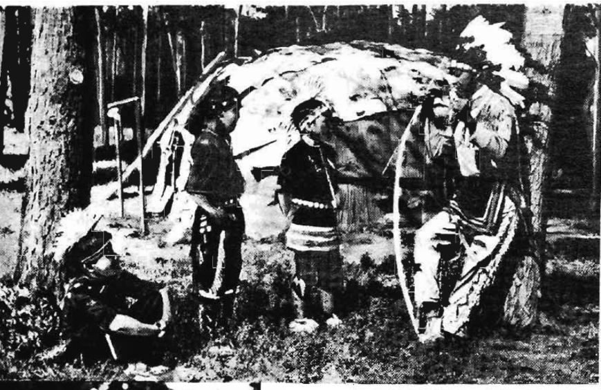
ANOTHER card from the Curteich series (right) that caricatured Minnesota's Ojibway