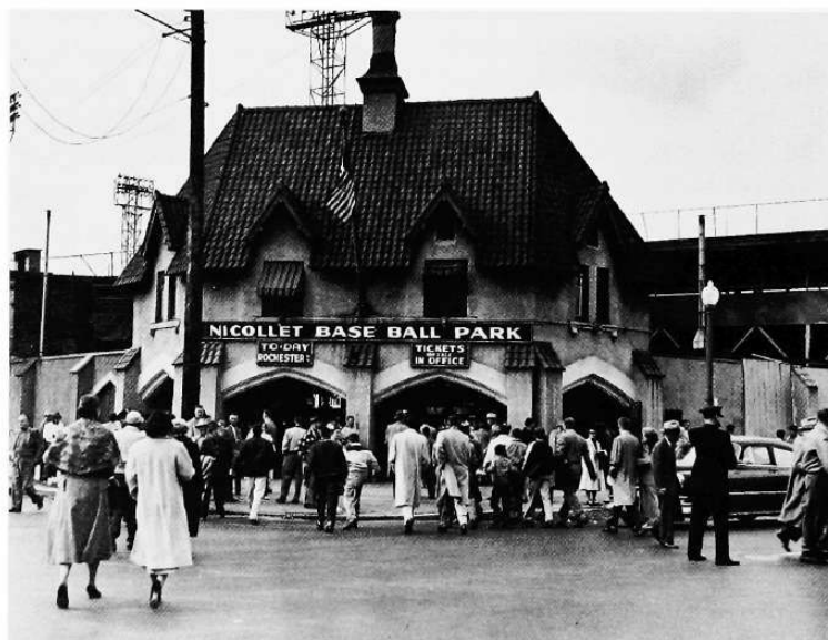
A CROWD enters Nicollet Park in September, 1955, for one of the last games held in the stadium.

THE CARTOON on p. 21 is from the Minneapolis Journal , March 31, 1985. All other pictures are from the MHS audio-visual library.