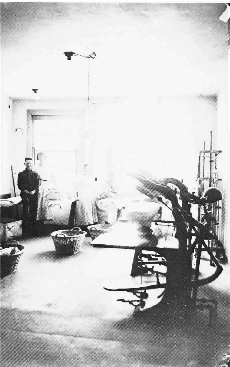
LAUNDRY workers, Minneapolis, about 1920

one percent of whom so much is known, and the huge majority about whom we know so little. Few working-class Norwegians, like their neighbors and coworkers of other ethnic groups, have had biographers and journalists to celebrate their lives and careers. They did not leave a profusion of personal papers to archives. The little that is known about their lives has been gleaned from a few letters and diaries and through a careful reading of elite writings. From these scant sources a picture of the majority immigrant experience begins to emerge.