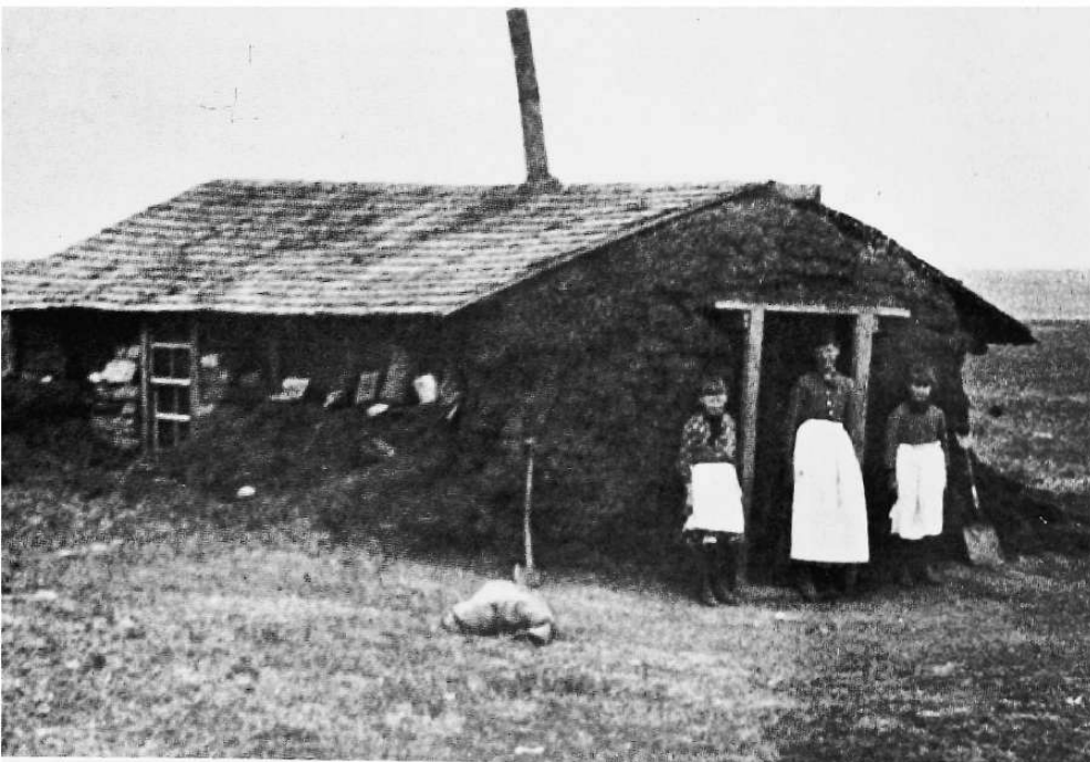
A WOMAN FARMER and her children, near Jasper, Pipestone County, 1889