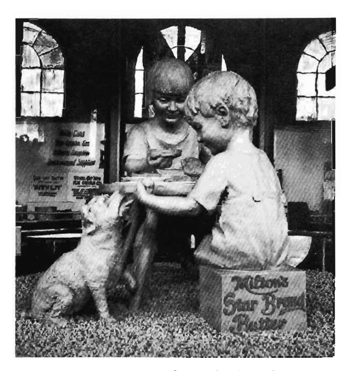
A 1920s State Fair butter display by the Milton Dairy; the boy sits on a standard, 68-pound box of bulk butter.

<sup>20</sup> Speer and Frost, Minnesota State Fair, 121, 128, 129, 134, 139. For the wide variety of displays at dairy expositions, see Exhibition of Models for the Monument to the Pioneer Woman held at the Minnesota State Fair and the Northwest Dairy Exposition, September 3-10, 1927 (New York: Reinhardt Galleries, 1927), unpaginated promotional pamphlet; on the Canadian butter sculpture, see Allwood, The Great Exhibitions, 128-129.