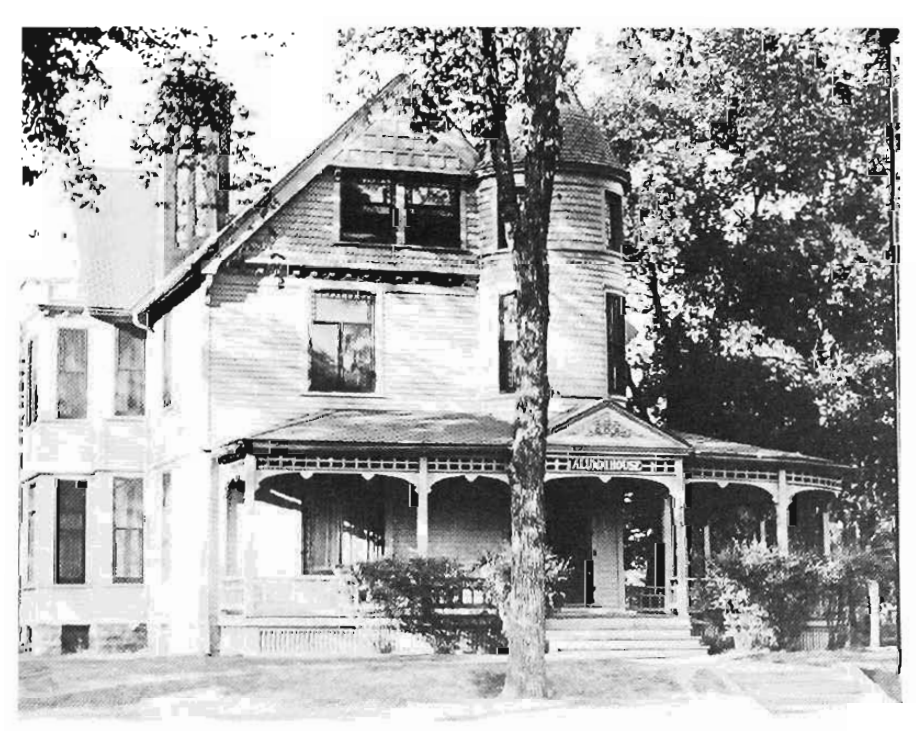
ALUMNI HOUSE at 1495 Hewitt Avenue, St. Paul, as it looked in 1933

The mending of fences had begun on all fronts. When the fall term opened there were an estimated 482 students enrolled, 217 of them freshmen. The increased enrollment was proudly announced and widely circu-