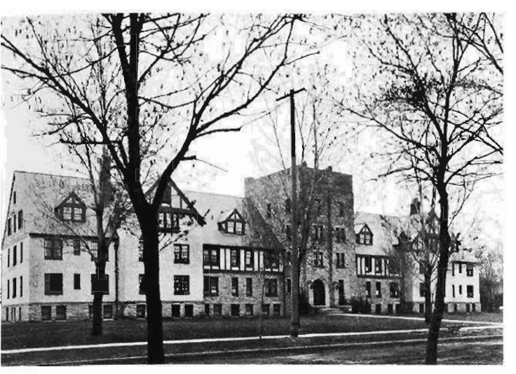
MANOR HOUSE, women's dormitory. in 1925